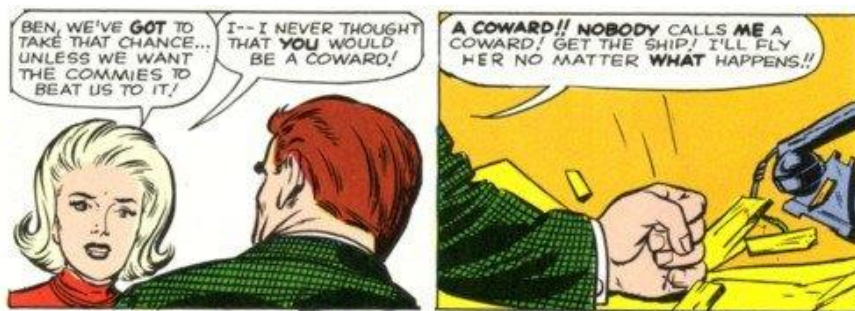
Fig. 1-Source: Stan Lee, Jack Kirby, “Fantastic Four!” Fantastic Four #1 . Nov. 1961 Marvel Publishing. Marvel Comics