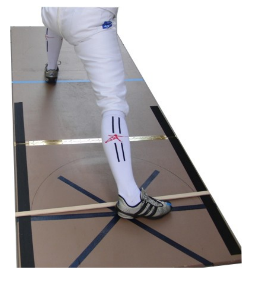
Figure 1 . Testing platform for lunge testing. The bar acts as a kinesthetic reminder to maintain non-leading foot position.