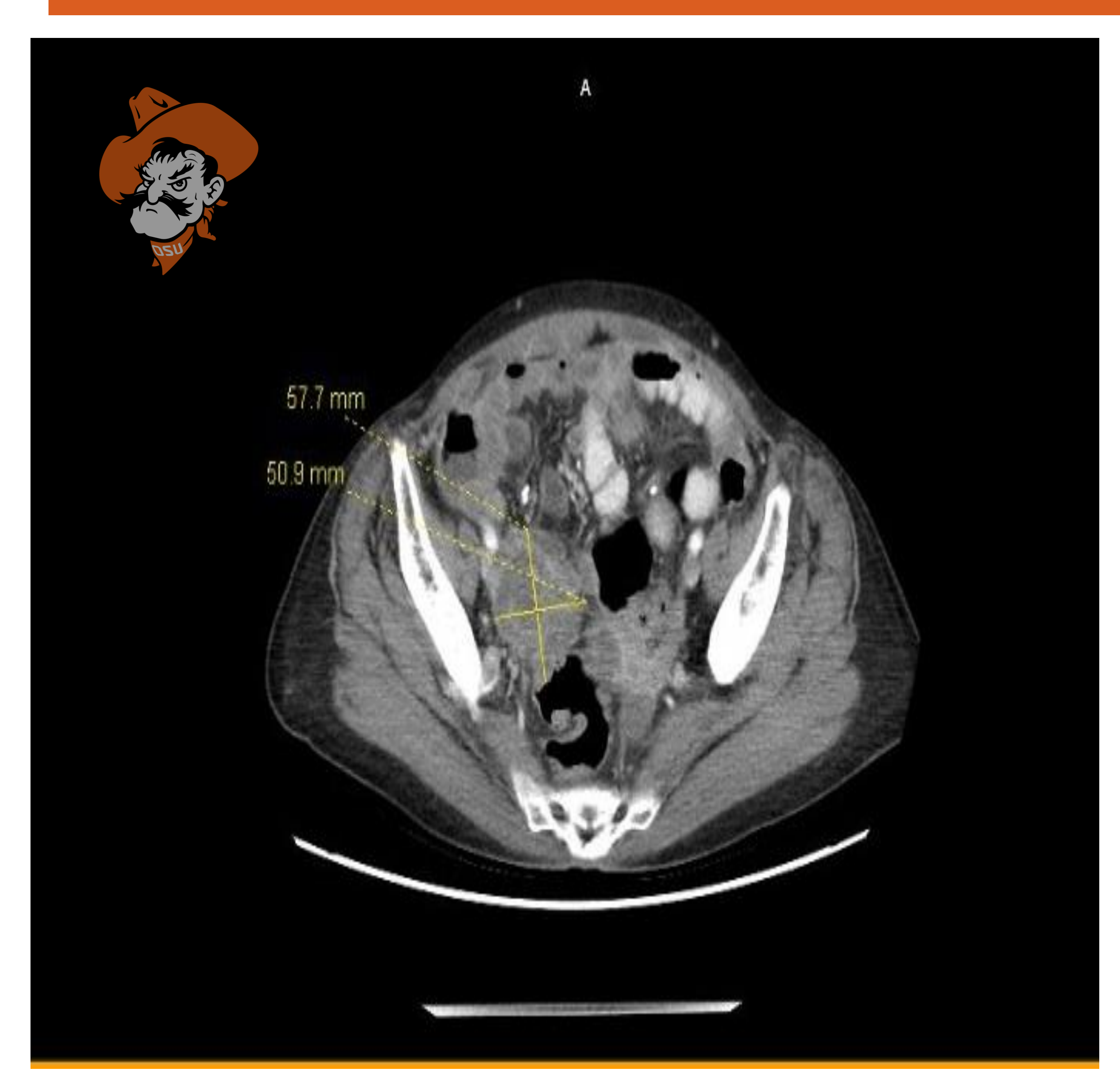
Figure 1: CT Abdomen Pelvis With Contrastmultiseptated cystic right adnexal mass measuring 5.8 x 5.1