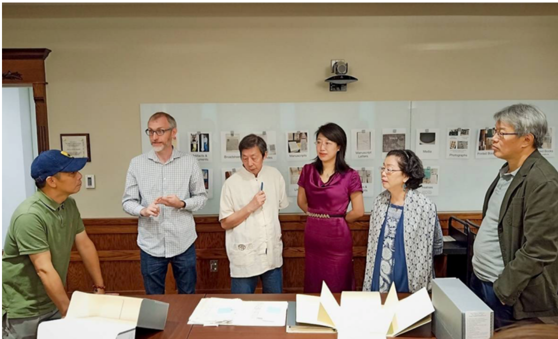
Photo of the U.S.-China Poetry Dialogue delegation exploring the Howard Goldbatt Archive, 5th floor, Bizzell Memorial Library.