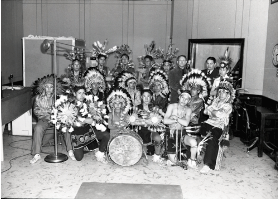
is of a school group, presumed to be students from the Pawnee Indian School, in the WNAD studio (1942). The Pawnee Indian School was the first school group to perform on the show, returning multiple times.

Later that evening, a tribute performance will draw upon the knowledge and talent of eight groups representing tribes or schools who often participated on the original radio show. The 7 p.m. performance will be in the Sharp Concert Hall of the OU Catlett Music Center as a part of the Ruggles Native American Music Series.