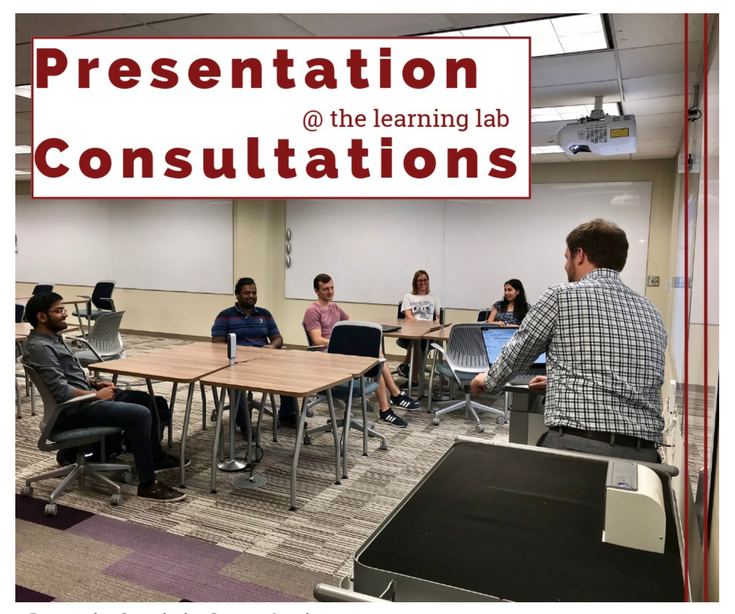
Presentation Consultation Summer Appointments

The new Presentation Consultations @ the Learning Lab service <u>has had a strong spring semester</u>. The service will continue through the summer by appointment only. If you or your students have presentations over the summer, <u>book your consultation online</u>.