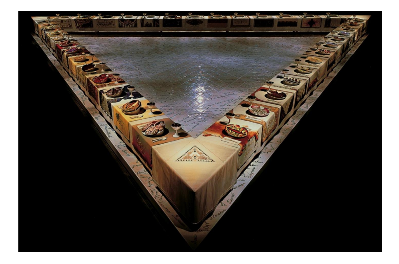
Figure 1 Judy Chicago The Dinner Party 1979 Mixed Media Brooklyn Museum, New York