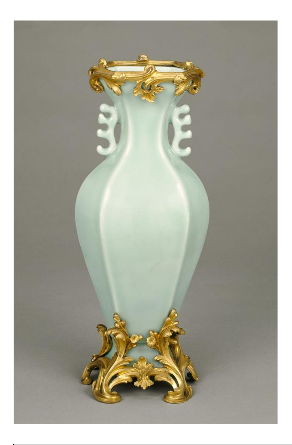
Figure 9 Vase, Qing Dynasty c. 1740 with French gilt-bronze mounts c. 1745-50, the vase of Jingdezhen porcelain with a pale celadon-green glaze Height with mounts 36.8 cm. J. Paul Getty Museum, Los Angeles.