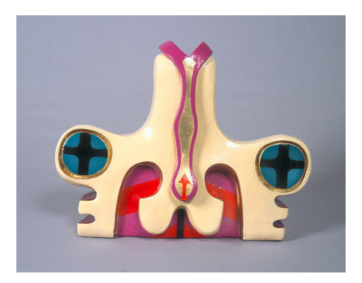
Figure 2 Judy Chicago Bigamy 1964 Acrylic on Ceramic 15.5 x 20 x 8 in.