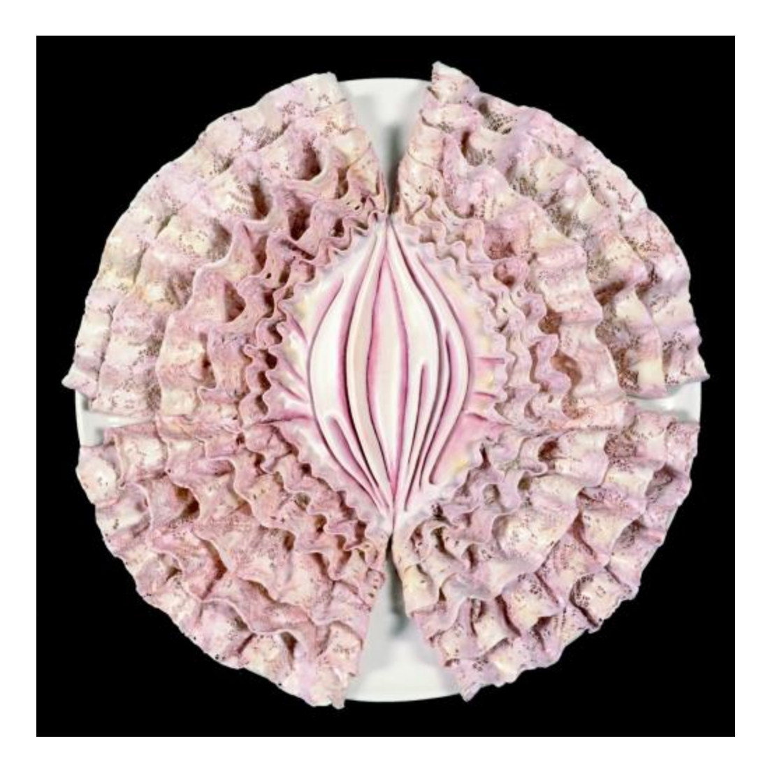
Figure 6 Judy Chicago The Dinner Party (Emily Dickinson plate) 1979 Porcelain (or possibly stoneware), overglaze enamel (China paint), and possible additional paint Brooklyn Museum, New York