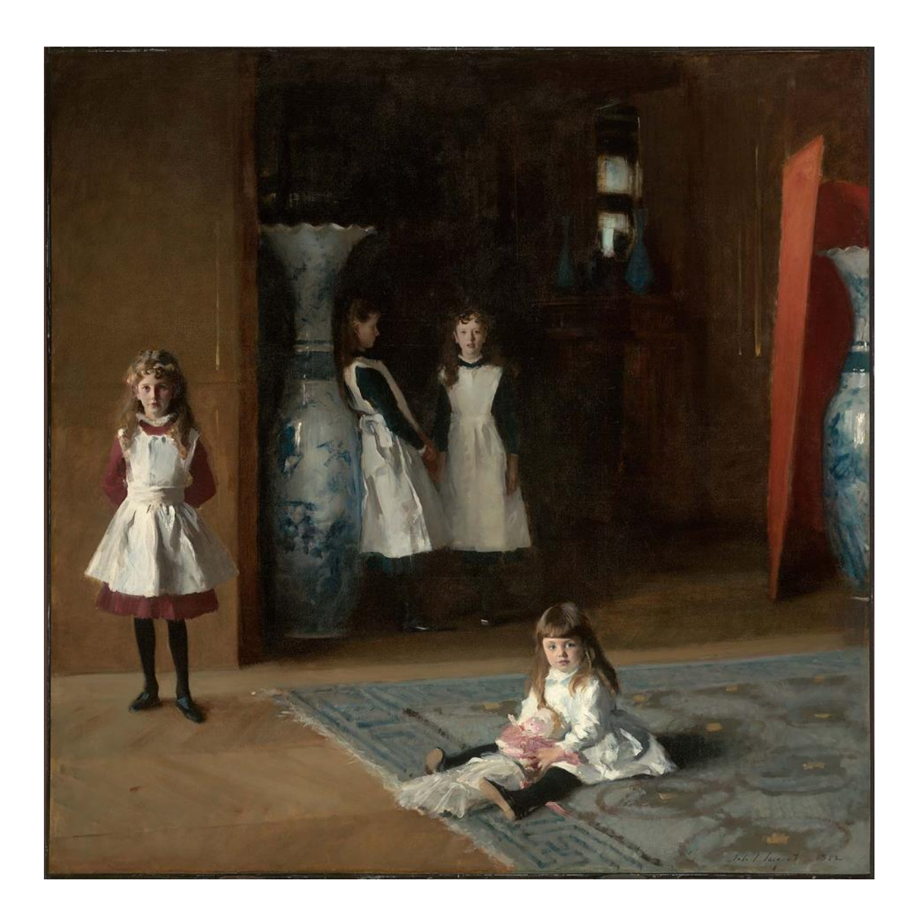
Figure 11 The Daughters of Edward Darley Boit John Singer Sargent 1882 Oil on Canvas 1882, 221.93 x 222.57 cm Museum of Fine Arts, Boston