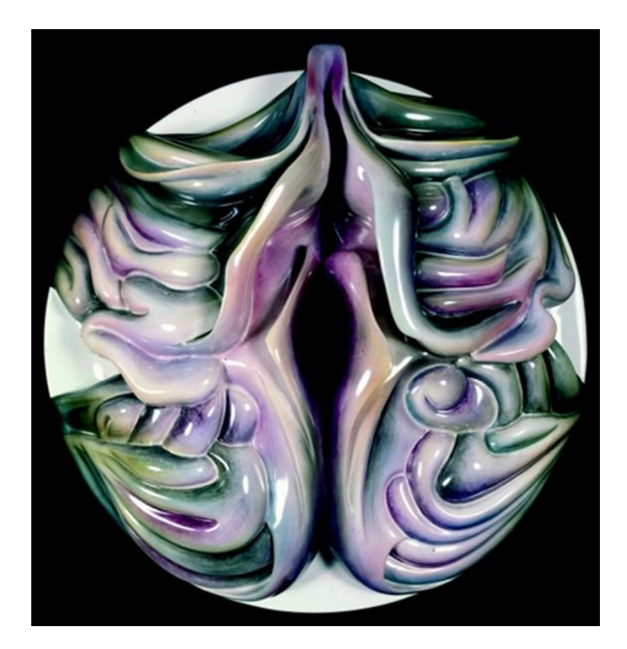
Figure 10 The Dinner Party (Detail of Georgia O'Keffee) Judy Chicago 1979 Mixed Media Brooklyn Museum, New York