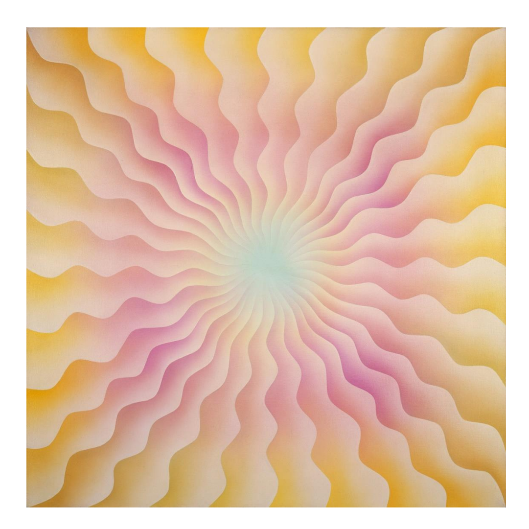
Figure 3 Judy Chicago Marie Antoinette , from the Great Ladies series 1973 Sprayed acrylic on canvas 40 x 40 in.