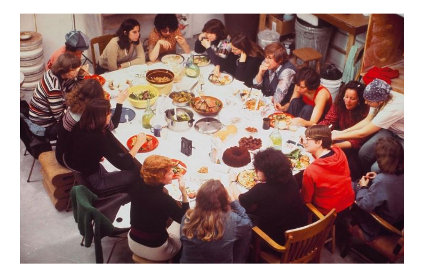
Figure 5 Judy Chicago "Potluck in the dinner Party studio" Through the Flower Archives.