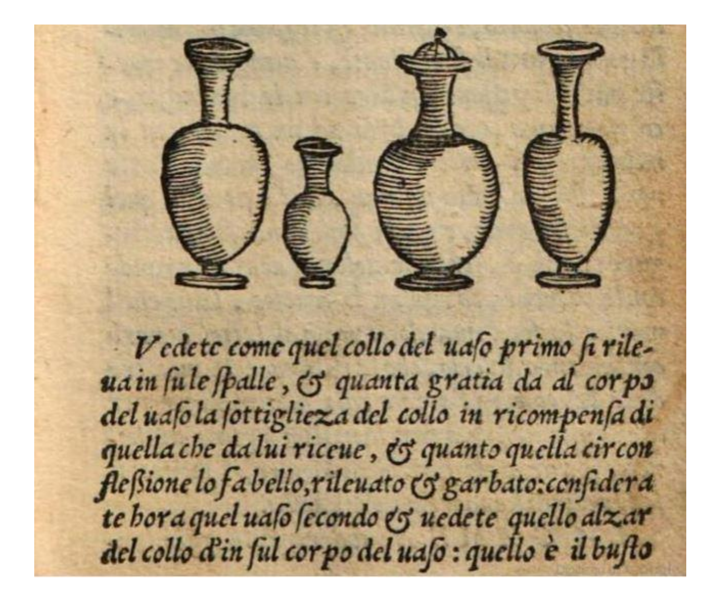
Figure 7 Detail of four vases from Dialogo delle bellezze delle donne ( On the Beauty of Women ) Agnolo Firenzuola 1542 Page 43