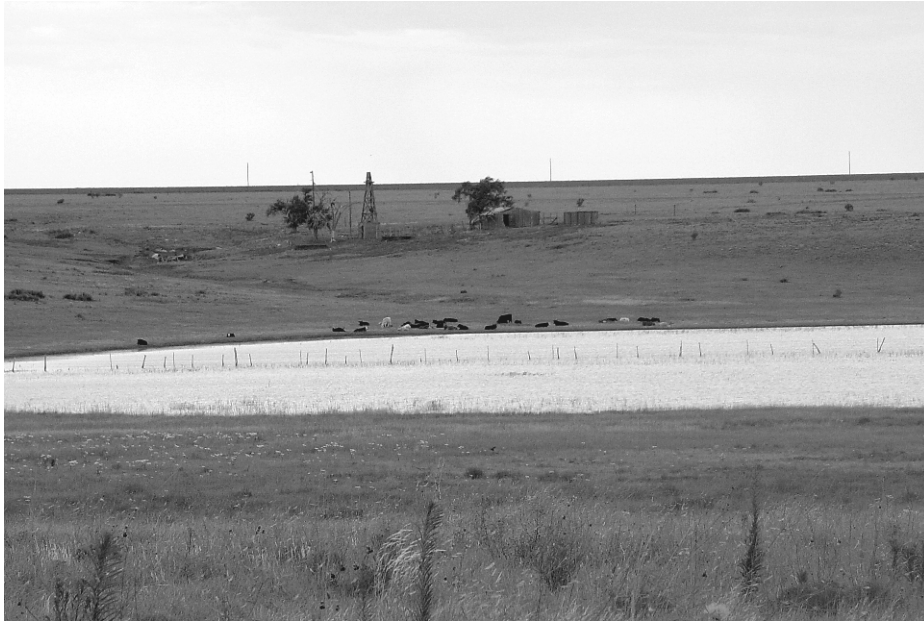
PLATE 1. A playa with a native short-grass prairie watershed in the Texas High Plains, USA.

grass ( Sorghastrum nutans ). Playa catchments are now dominated by cotton agriculture in the Southern High Plains (eastern New Mexico and northwestern Texas), while wheat, corn, and soybean production dominates catchments in the northern portions of the region (Smith 2003). Intensive livestock grazing occurs in wetlands and catchments throughout the High Plains (Smith 2003).