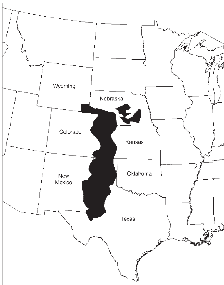
FIG. 1. The High Plains region containing playas in the United States.

Plains, the vast majority are depressional recharge wetlands, termed playas. As an example of the importance of these wetlands on the landscape, playas historically have conservatively covered >120 000 ha of the Texas High Plains alone, with individual wetland area ranging from <1 ha to >300 ha (Haukos and Smith 1994). Estimates of the number of historical playas for the entire region range from 25 000 to 50 000, variously based on the presence of hydric soils on soil maps, topographic maps, National Wetland Inventory maps, satellite imagery, and aerial photo coverage (e.g., Guthery et al. 1981, Sabin and Holliday 1995; Playa Lakes Joint Venture 2007, available online ). 6 Because of their geographic coverage and numbers in an area extensively influenced by USDA programs, High Plains playas were identified as key systems for inclusion in the national CEAP-Wetlands assessment. As part of the national synthesis, our paper (1) summarizes key ecosystem features of playas, (2) reviews the state of