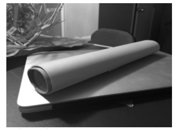
Design against runaway trace