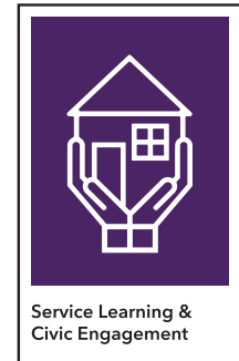
Service Learning & Civic Engagement