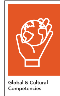
Global & Cultural Competencies