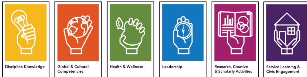
UCO's Central Six Core Value Tenets

The Student Transformative Learning Record (STLR) is UCO's way of assessing and recording students' Transformative Learning (TL) experiences. While the traditional academic transcript gives a snapshot of students' Discipline Knowledge , STLR captures students' growth in the other five of the Central Six Tenets: