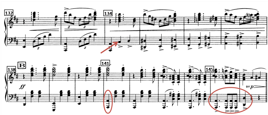
Example 19: La Valse , A section, conclusion, mm. 132-146.