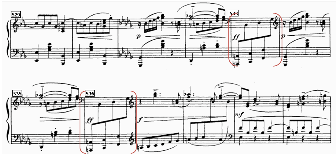
Example 32: La Valse , A' section, Pas de deux , one-measure interruptive octave figures, mm. 529-540.

Her fright continues with seven repetitions of a one-measure motive in ascending thirds with a continuous crescendo (mm. 550-556, in Example 33). During these measures the ballerina tries to run away from Death, but she is not successful. Instead, Death keeps controlling her, which results in their repetitive circling movements.