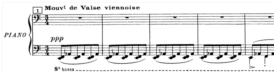
Example 5: La Valse , minor second and diminished fourth, mm. 1-4.

Ravel frequently used the major seventh (diminished octave) and minor second in his piano music. Almost three-quarters of all his solo piano pieces either begin or end (or both) with a major seventh or minor second: Sérénade grotesque (ending); Menuet Antique ; Jeux d'eau ; Sonatine (ending); “Noctuelles,” “Oiseaux tristes,” and “Alborada del gracioso” from Miroirs ; “Ondine” and “Scarbo” from Gaspard de la nuit ; Menuet sur le nom d’Haydn ; each movement of the Valses nobles et sentimentales ; and five of the six movements of Le Tombeau de Couperin . La Valse also starts with a minor second sonority. The opening two notes are in minor second (E and F) followed by A b . Here, the use of the lowest register of the keyboard and combination of minor second along with the simple ostinato accompaniment pattern creates the dark and mysterious opening sonority of La Valse (see Example 5).