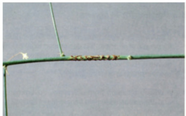
Figure 4. Brick-red pustules on a fern branch with rust.

Asparagus rust occurs to varying degrees wherever asparagus is grown. The fungus attacks developing ferns after cutting has been terminated. Rust may also develop on ferns allowed to develop during cutting. Rust appears first as raised, green spots (pustules) on stems and branches of developing ferns. Spores from these pustules re-infect ferns and produce brick-red pustules on stems and branches (Figure 4). A different spore type from these brick-red pustules also re-infects ferns and results in increased rust pressure. Rust is easily identified at this stage by observing the rust-colored