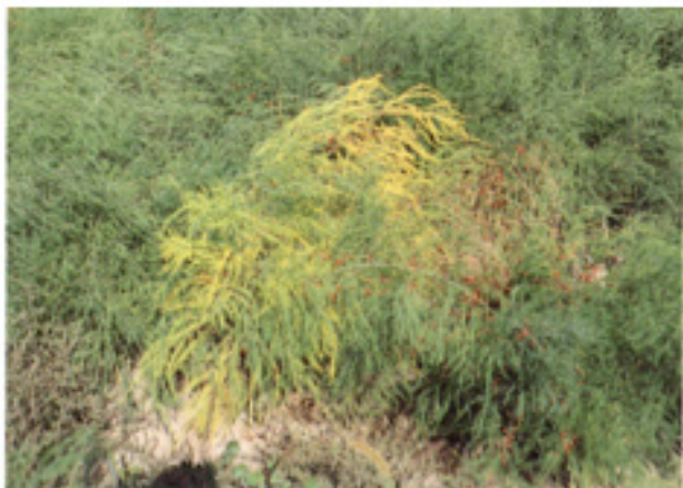
Figure 2. Yellowing of fern caused by Fusarium stem, crown, and root rot.

Control: Control of this disease is extremely difficult once it becomes established in a field. Therefore, measures should be taken to exclude it from fields. This is primarily done by planting healthy, vigorous crowns. For direct seeding, soak seeds in diluted chlorine bleach (1 pound of seed per gallon of a 1 part bleach/8 part water dilution) for 40 min., dry, and apply a fungicide seed treatment before planting. Consider