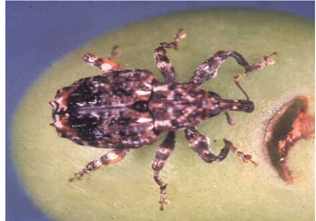
Figure 1. Plum curculio adult next to crescent-shaped oviposition scar on peach.

A complete life cycle, from egg to adult, takes about 50 to 55 days; however, temperature and moisture conditions play a major role in regulating plum curculio development and activity. Weevil adults need water before much activity takes place. In addition, weevils are more active on warm, damp, cloudy days and in thick, heavy stands of trees that provide abundant moisture in the center of the orchard. Curculio activity