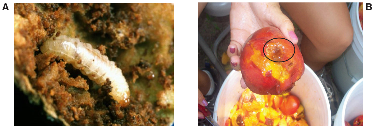
Figure 3. Larval stage of the plum curculio showing A) close up of the small larva and large amounts of frass (insect excrement) and B) The larva (encircled) adjacent to bruised area and frass accumulation.

In March, when temperatures reach or exceed 70° F for two days, growers should begin to accumulate degree days within their orchards. A degree-day-based model helps growers time scouting and/or trapping of plum curculio. The model uses a base temperature for weevil development of 50° F. Treatment is justified between 100 and 400 degree days (generally April) if the threshold (0.045 weevils/trap/day) is reached and/or 1 percent of new plum curculio damaged peach fuzz or crescent-shaped feeding wounds are found on peaches. After 1,000 degree days (early June and later), treat if trap captures exceed the same threshold, and repeat spraying at 10-day intervals if trap catch and/or new damage dictates.