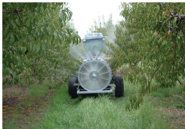
Figure 4. Airblast sprayer in peach orchard.

Once a threshold has been obtained in an orchard, treatment should be conducted using an airblast sprayer calibrated to deliver a minimum of 40 to 50 gallons per acre (Figure 4). For maximum benefit, many growers will calibrate their sprayers to spray 100 gallons per acre. Airblast sprayers come in a number of sizes. Some larger sprayers can reach the tops of trees in excess of 80 feet and provide excellent coverage to the entire canopy. This may be overkill for fruit trees which do not typically grow to that height. Regardless of insecticide selected, multiple applications will likely be needed throughout the weevil season, especially if fruit are marketed for retail sales. Commercial growers should be encouraged to treat at least two sides of each tree when making pesticide applications; this ensures penetration and thorough coverage. For a complete listing of pesticide recommendations on peaches, including information on fungicides to protect trees from disease infection, consult OSU Current Report CR-6240. This publication is revised each year and contains detailed, current information on chemical recommendations for peaches and nectarines.