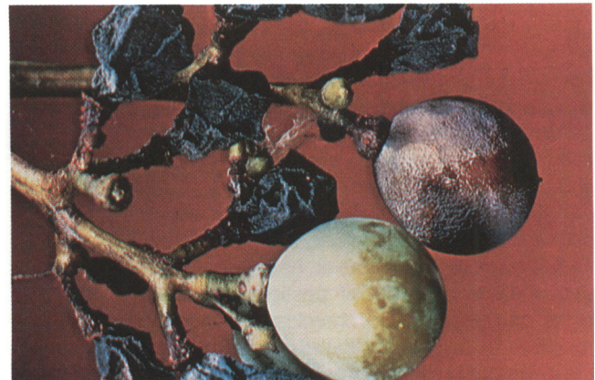
Fig. 4. Shriveled, black, infected grapes (mummies) covered with sexual fruiting bodies of the black-rot fungus.