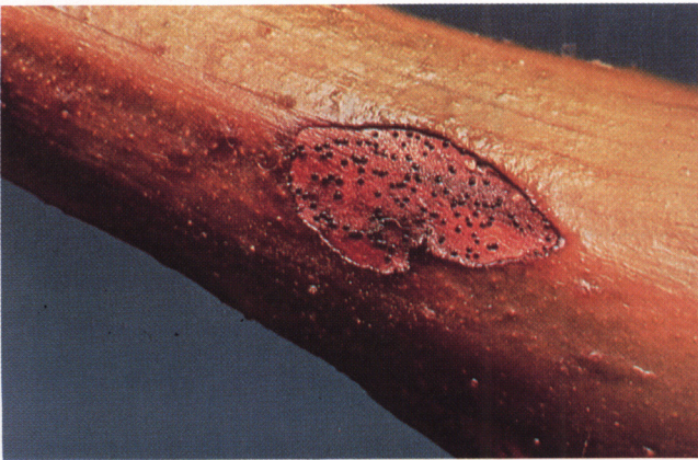
Fig. 3. Development of fruiting structures of the black-rot fungus in a lesion on a leaf petiole.