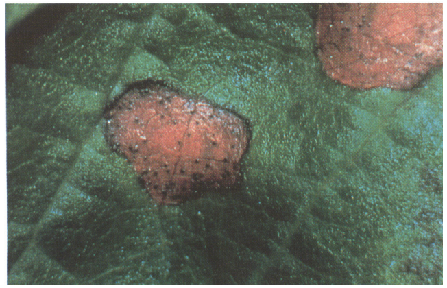
Fig. 2. Development of fruiting structures of the black-rot fungus in infection spots (lesions) on a leaf.