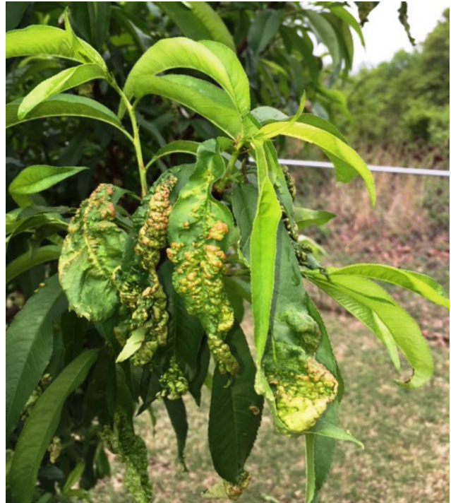
Figure 2. Peach leaves infected by the leaf curl fungus. Note puckering, deformation and change in color. Color changes usually occur long after initial infection.

Oklahoma Cooperative Extension Fact Sheets are also available on our website at: extension.okstate.edu