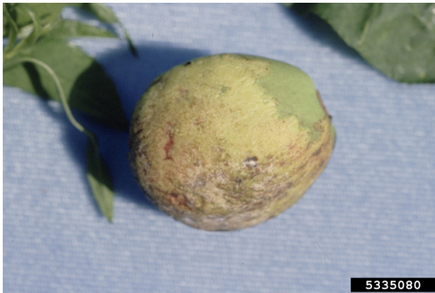
Figure 4. Fruit infected by the leaf curl fungus.

The leaf curl fungus not only infects leaves, but also tender growing shoots and, more rarely, blossoms and fruits. Infected twigs become slightly swollen, may be yellowish and remain stunted. Infected blossoms and fruit usually fall early in the season. However, some infected fruit may remain in the trees. Diseased fruit will show shiny, raised, warty or discolored areas (Figure 4).