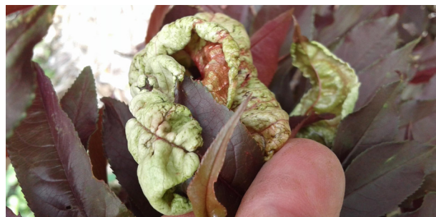
Figure 3. Puckered areas on leaves may turn yellow or reddish-brown and occasionally powdery to gray spores can be observed on the leaves.