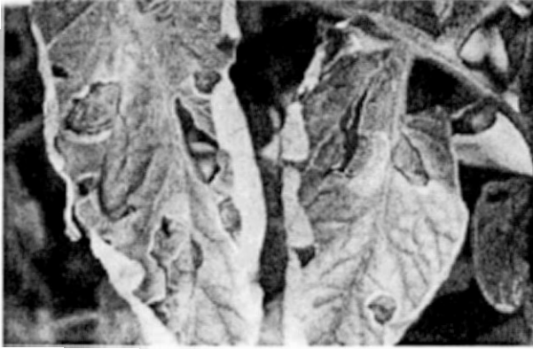
Figure 3. Early blight —Leaf symptoms are large (up to 1/2 inch diameter), brown, zonate or target-like spots.

in association with diseased tomato debris that are capable of persisting for one year and probably longer. Infection occurs rapidly under warm, humid conditions. Thousands of spores are produced in spots of infected leaves that are capable of causing more infections. Plants under stress from nitrogen deficiency, heavy fruit load, or other factors are most susceptible to the disease.