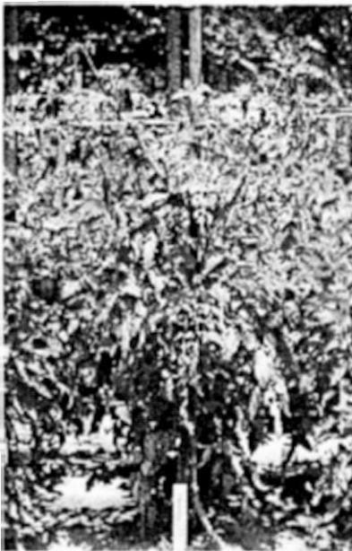
Figure 1. Fusarium wilt—Initial symptoms are yellowing of older leaves which progresses upwards and later wilt and die.

The initial symptom of southern blight is a rapid wilting of the entire plant. A water-soaked lesion on the stem near the soil line rapidly expands, turns brown, and girdles the stem. A white mold (mycelium) eventually covers the stem lesion and surrounding moist soil. Small, uniformly round structures about 1/16 inch in diameter, called sclerotia, form on the mycelium. Sclerotia are first white, later becoming brown, and resemble mustard seeds. The presence of the white mycelium and sclerotia at stem base of affected plants are very useful characteristics for identifying southern blight (Figure 2).