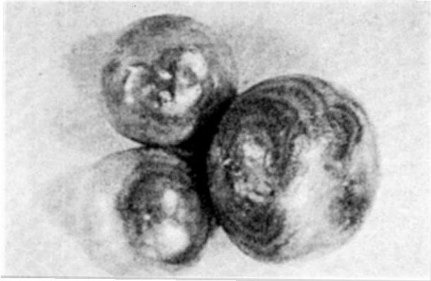
Figure 7. Buckeye rot —Brown concentric rings resemble markings of a buckeye chestnut.