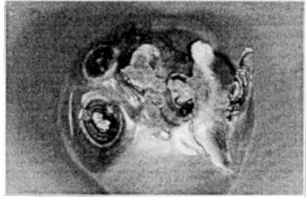
Figure 8. Rhizoctonia soil rot —Symptoms are alternating light-and dark-colored zonate bands on fruit surfaces in contact with soil.

Control: Tomatoes should be staked or otherwise held upright to minimize fruit contact with soil. Avoid planting tomatoes in poorly drained soils or in low areas of a field. Mulching with plastic film or with organic matter to keep fruit from contacting the soil and/or to reduce soil splashing onto fruit will reduce the chance of soil rot infection. A fungicide spray schedule for foliar disease control may also help reduce infection, provided coverage of the fruit is achieved.