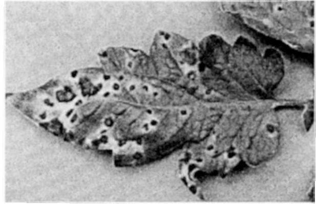
Figure 4. Septoria leaf spot —Leaf symptoms are small (1/8 inch diameter) spots with gray centers and dark borders.

Control: Crop rotation and thorough shredding and incorporation of infested plant residue soon after harvest are recommended to reduce Septoria leaf spot. Weed control should be maintained because jimsonweed, horse nettle, and nightshade are also sources of infection. Drip but not sprinkler irrigation is recommended to reduce periods of leaf wetness and water splashing. Avoid working plants while foliage is wet. A fungicide spray schedule for early blight will also be effective for control of Septoria leaf spot.