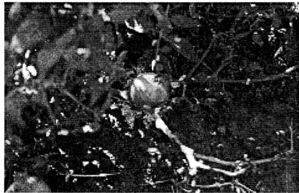
Figure 2. Southern blight—White moldy growth (mycelium) develops at the base of infected plants.

The fungus survives in the soil by forming resistant spores