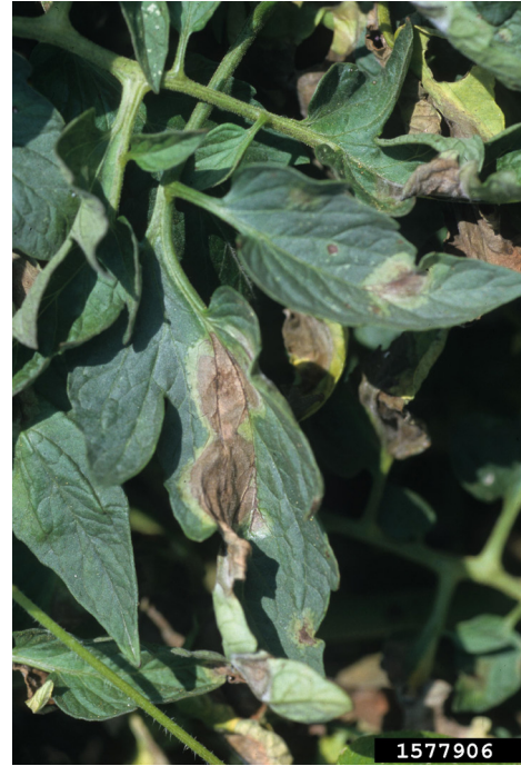
Figure 6. Late blight—Foliage symptoms are dark blotches surrounded by pale green borders.

margins of affected areas. If stems and petioles are infected, areas above these infections wilt and die. Entire plants may be rapidly defoliated when conditions favor the disease. Fruit infections begin as brown, greasy spots that rapidly expand to rot the entire fruit.