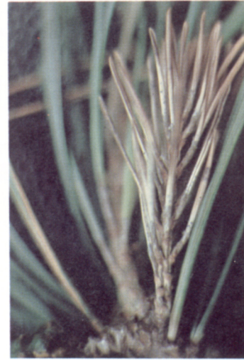
Figure 2. Stunted terminal branch of pine infected with Diplodia pinea .

Small black elliptical fruiting bodies of the fungus are produced on the needles. These structures break open in the late spring or early summer during periods of wet weather and release great numbers of spores. The spores can be spread by splashing rain or wind to infect other needles or trees.