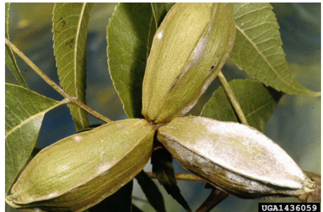
Figure 4. Nuts of a pecan tree infected by powdery mildew fungus.