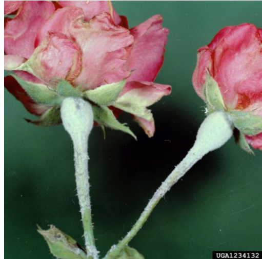
Figure 2. Powdery mildew on rose flower receptacle and stem.

When powdery mildew has been a problem in previous years, a recommended fungicide spray schedule should be started in the spring as new growth develops. The fungicide should also be applied during the flowering period to avoid blossom blight. For suggested fungicides refer to the current circular E-832, OSU Extension Agents' Handbook of Insect, Plant, Disease, and Weed Control. Be sure to follow the instructions on the label for use on specific applications.