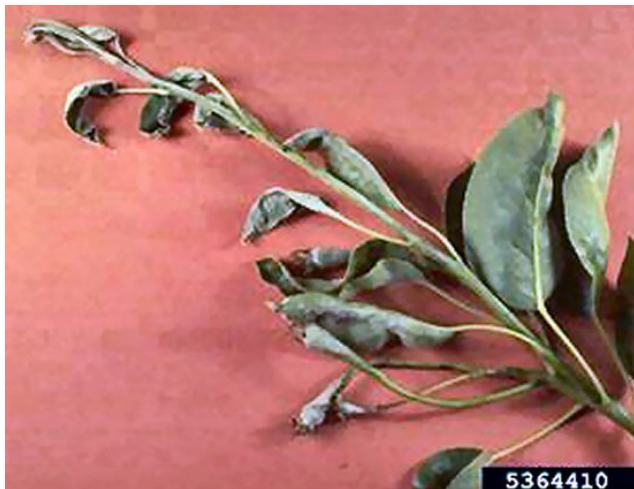
Figure 3. Severe powdery mildew on young pear leaves, causing distortions.