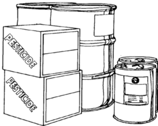
Figure 3. Store Pesticides with Label Plainly Visible.

All pesticide containers should be checked often for corrosion, leaks, and loose caps or bungs. These dangerous conditions must be corrected immediately. You may be able to position or rotate a can or drum that has been punctured to put the hole on top to stop the content from escaping, or