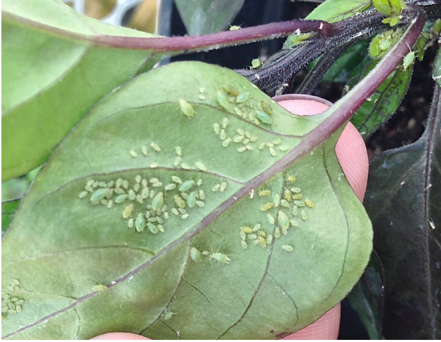
Figure 1. Green peach aphid, Myzus persicae , on ornamental pepper.