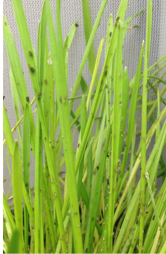
Figure 3. Bird cherry oat aphid, Rhopalosiphum padi , on winter wheat. (T.P. Miller)

When pest aphids aren’t present in the greenhouse, A. colemani is sustained on the bird cherry-oat aphid. However, the parasitoid has a preference for green peach and cotton/melon aphids over bird cherry-oat aphids. When populations of green peach aphid or melon aphid increase, A. colemani switches prey and begins attacking pest aphids within the crop. This system works best if established slightly before or at the start of the crop cycle. Different species of parasitic