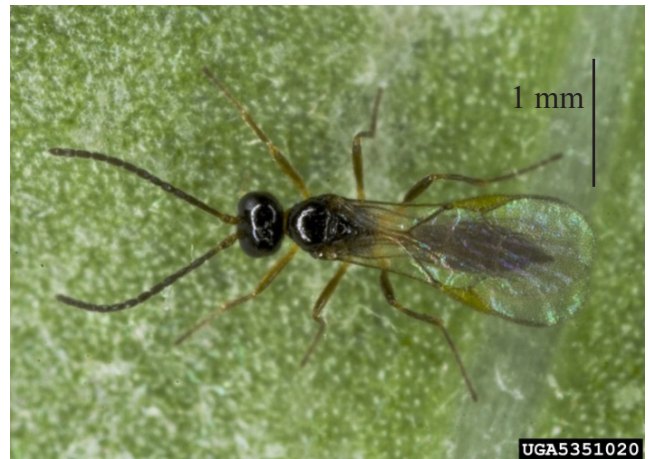
Figure 4. Aphidius colemani parasitoid.

wasps (Table 2) that use alternate aphid prey on cereal grains may be reared in the same fashion.