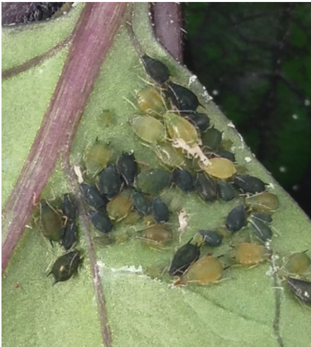
Figure 2. Cotton melon aphid, Aphis gossypii , on ornamental pepper. (T.P. Miller)

parasitizing them by laying an egg within their bodies. Upon hatching, the wasp larva consumes its aphid host from within and eventually completes its development. When the larva pupates, the aphid swells in size, hardens and turns brown, resulting in what is called a “mummy” (Figure 5). The adult wasp eventually emerges from the mummy through a smooth, round exit hole.