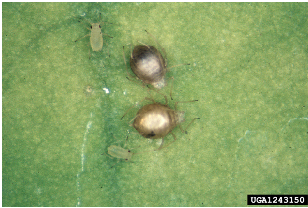
Figure 5. Two aphid mummies next to two non-parasitized aphids.