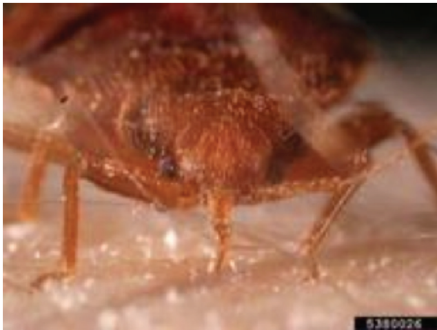
Figure 5. Bed bug feeding with needle-like beak.