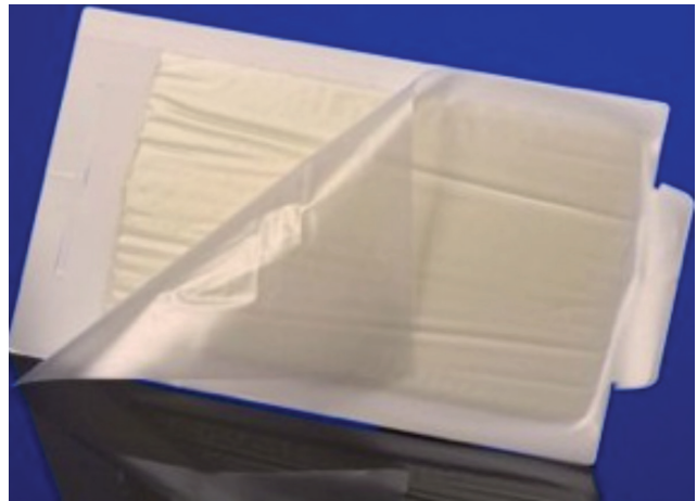
Figure 3. Sticky trap/glue board used to catch insects.

Pest control companies will have different options. Heat treatments have proven to work well (Figure 4), but chemi-