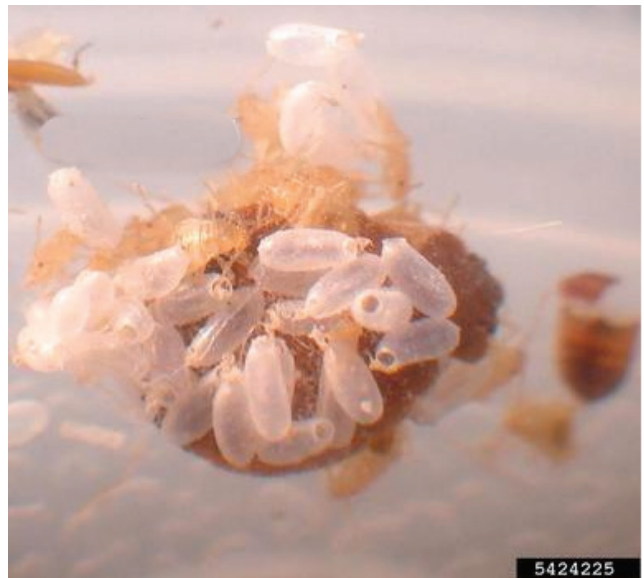
Figure 6. Bed bug eggs.