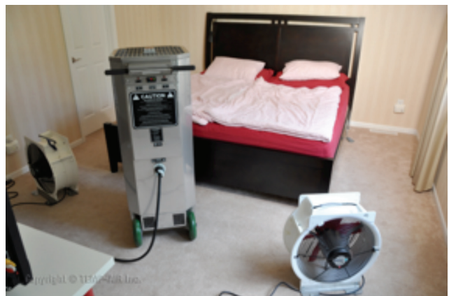
Figure 4. Heat treatment in bedroom.