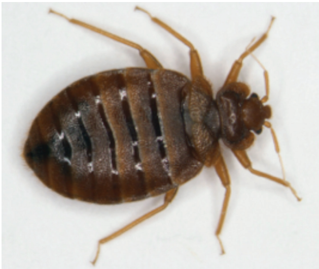
Figure 1. Adult bed bug.

If you think you may have bed bugs, the first step to manage them is accurate identification. The most important thing to do is make sure the bug in your home is actually a bed bug (Figure 1). There are several other insects that are commonly mistaken for bed bugs. Just because you have skin irritation or bites does not mean bed bugs are the cause. Many insects can bite and cause skin welts and skin irritation.