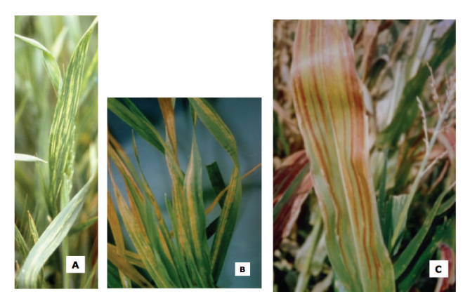
Figure 2. Symptoms of wheat streak mosaic (WSM) and high plains disease (HPD) on wheat (A and B, respectively) and of HPD on corn (C). Symptoms of Triticum mosaic on wheat are similar to those of HPD (B).

When WSMV infects wheat by itself, symptoms typically include yellow streaks with a green background (indicative of a later/mild infection – Figure 2A) or greenish streaks with a yellow background (indicative of an early/more severe infection). Other symptoms on wheat leaves caused by all three viruses are similar and include yellowing, desiccation of foliage, and leaf death (Figure 2A-2B). Stunting also is a typical symptom and can range from severe (if infection occurred in the fall or early spring) to mild (if infection occurred later in the spring). It is not difficult to determine that plants have symptoms of these viral diseases in the field, but laboratory testing is required to identify the specific virus(es) present.