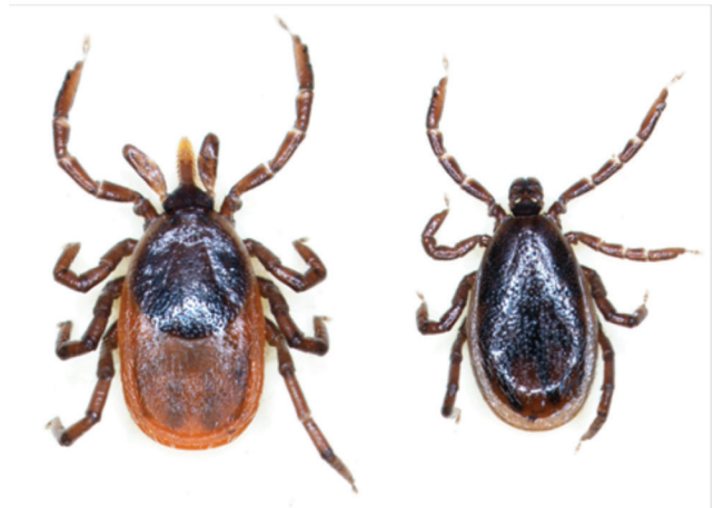
Figure 3: Deer tick or Black-legged tick ( Ixodes scapularis ) female (L) male (R).

The adults become active in late September and October and are present until March or April. During the early fall, it is often the most common tick on deer and cattle in Oklahoma. The larvae and nymphs are active in the spring and summer and feed on snakes and lizards. In Oklahoma, the black-legged tick is not known to transmit Lyme disease, because the larval ticks do not feed on mice that serve as reservoir hosts for the bacteria.