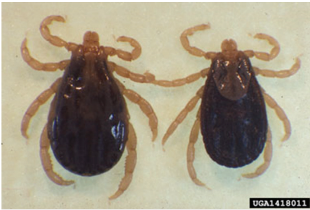
Figure 4: Winter Tick ( Dermacentor albipictus ) female (L) male (R).

ally deer or cattle. Heavily infested range animals may die from blood loss if left untreated. The winter tick is a vector of anaplasmosis in cattle.