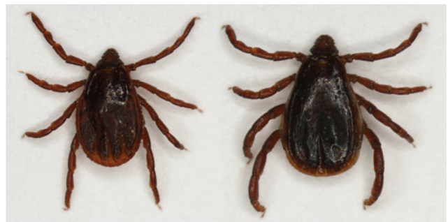
Figure 6: Brown Dog Tick ( Rhipicephalus sanguineus ) female (L) male (R).

The adult ticks are most often found in the ears and between the toes of dogs. The larvae and nymphs are found in the long hair on the back of the neck. The eggs are deposited in cracks and crevices of the dog kennel. These ticks have a tendency to crawl upward and are commonly found in cracks in the roof of dog kennels or ceilings of porches. These ticks will also become established in houses and other buildings that are inhabited by dogs. The brown dog tick transmits a wide range of pathogens to dogs that include Anaplasma platys , Babesia canis , Babesia gibsoni , Ehrlichia canis , Hepatozoon canis and Rickettsia rickettsii .