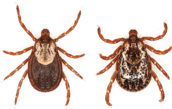
Figure 5: American Dog Tick ( Dermacentor variabilis) female (L) male (R).

The American dog tick is the only known vector of Rocky Mountain spotted fever (RMSF, Rickettsia rickettsii ) in