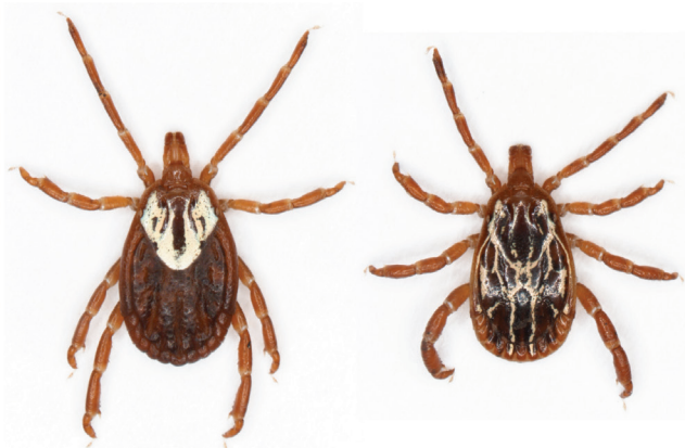
Figure 8: Gulf Coast Tick ( Amblyomma maculatum ) female (L) male (R).

The Gulf Coast tick (Figure 8) is a three-host tick. As larva and nymph, the Gulf Coast tick is a common pest of ground-inhabiting birds, such as meadowlarks and bobwhite quail or small rodents. The adults primarily blood feed on cattle, but a variety of other hosts including dogs, horses, sheep, deer, coyotes and humans can be parasitized. This tick has become increasingly abundant in Oklahoma in the last 20 years and is an important pest of cattle and transmits Hepatozoon americanum to dogs and coyotes and possibly, Rickettsia parkeri to humans. The adults attach to the ears of cattle and are most abundant in early April to mid-June. When infestations are high on cattle, the ears may become thickened and curled causing a condition called “gotch ear.” This tick reportedly has produced tick paralysis in humans and dogs.