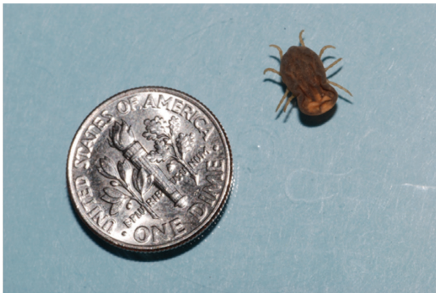
Figure 2: Spinose Ear Tick ( Otobius megnini ) nymph.

The spinose ear tick (Figure 2) is a common pest of cattle, horses and other domestic and wild hosts throughout Oklahoma. Humans have also been fed on by these ticks. The tick is found in the ear canals of its host. The presence of large numbers can cause severe irritation, inflammation and deafness of the animal. Secondary bacterial infections may cause sloughing of tissue into the ear canal. Infested cattle develop a “flop-eared” condition which causes discomfort in movement of the head.