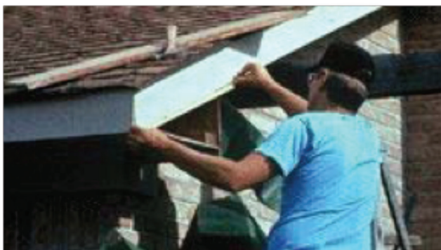
Figure 7. Bee proof the overhang in your home.

Look for cracks and holes that could be occupied by a colony. If appropriate measures are taken to screen or caulk holes, or fill cavities with insulation, honey bees will not be able to colonize. Overhangs and eaves in homes are places honey bees are likely to occupy and appropriate measures to cover them should be taken (Figure 7).