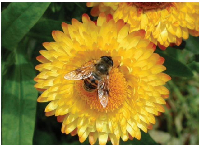
Figure 10. Syrphid fly

Syrphid flies (Figure 10) are black or brown with yellow banded abdomens and superficially resemble bees and wasps. However, they have only two wings which are not held over the back of the body when at rest. Some species are hairy and have a long, thin abdomen. Antennae are short, not elbowed, and the distal segment bears a strong hair (seta). These flower flies are harmless as adults, but serve as aphid predators in the larval stage.