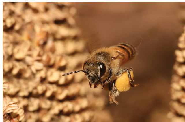
Figure 2. Worker honey bee carrying pollen.