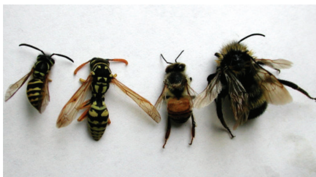
Figure 9. Yellowjacket, paper wasp, honey bee and bumble bee (left to right).

Bumble bees are relatively large and have a robust body. They are yellow and black and have soft, fine hairs. They have pollen baskets on their hind legs to carry food. They build their nests in or near the ground or occasionally use old bird nests. Females can sting more than once and they do not use dances to communicate with other bees.