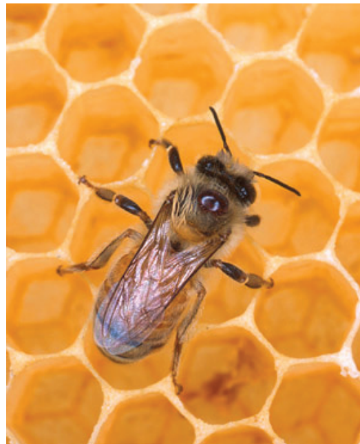
Figure 1. Honey bee queen depositing egg into comb.

Honey bees have a complex society with defined roles for each caste: the queen (Figure 1) mates with drones in a nuptial flight and lays several hundred eggs per day. Her body is considerably more elongated than that of drones or workers, especially during her egg-laying (oviposition) period. The queen cannot feed herself and needs help from the bees that take care of her. Her life span is one and a half to two years, after which a younger queen is produced within the same hive. The new queen takes over the colony and the old queen either dies, is killed, or is forced to leave. Worker honey bees (Figure 2) are also females. They will take care of brood (egg, larvae, and pupae) as young adults and forage for pollen and nectar later in life. Male honey bees or drones, do not collect pollen or nectar, are noticeably larger than workers, and their only known function is to mate with the queen. During late spring and summer, there is one queen, fifty to sixty thousand worker bees, and several hundred drones in a colony.