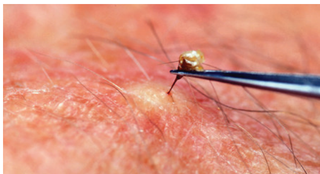
Figure 8. Honey bee sting.

What if you are stung? First, get away, run to the shelter of a car or building, and stay there even if some bees come in with you. Do not jump in water because bees, particularly AHB, will likely stay in the area until you surface. Once safe, remove stings (Figure 8) from your skin. It does not matter how you remove them, as long as you remove them quickly to reduce the amount of venom injected.