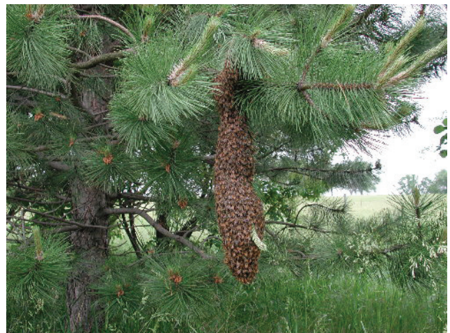
Figure 6. Honey bees swarming in a pine tree.