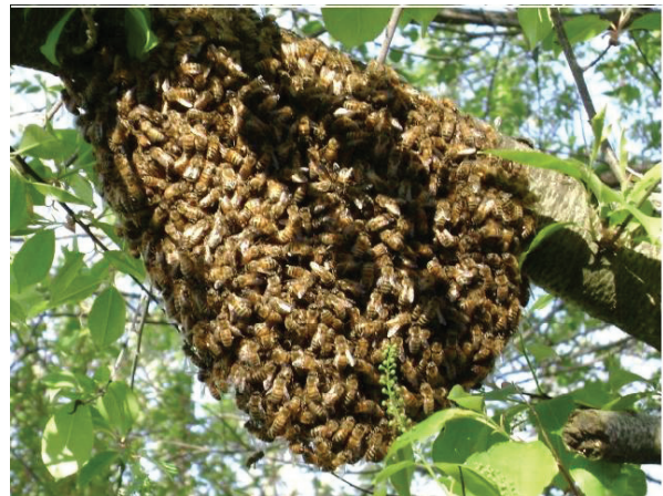
Figure 5. Honey bees swarming in a branch.