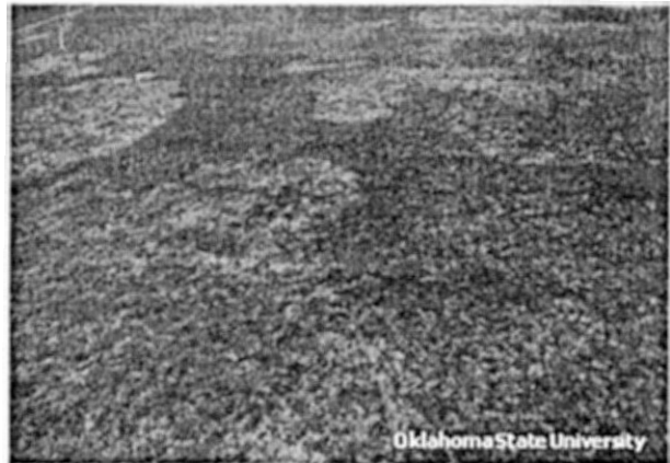
Figure 2. Symptoms of large patch on bermudagrass.

above 50° F, moisture is adequate, and may continue until dormancy. Fungal activity can resume in early spring but is suppressed by soil temperatures that exceed 85° F.