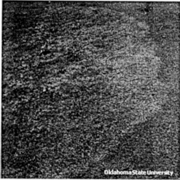
Figure 3. Symptoms of an actively expanding patch on bermudagrass caused by R. solani . Note the weed encroachment in the thinning areas.