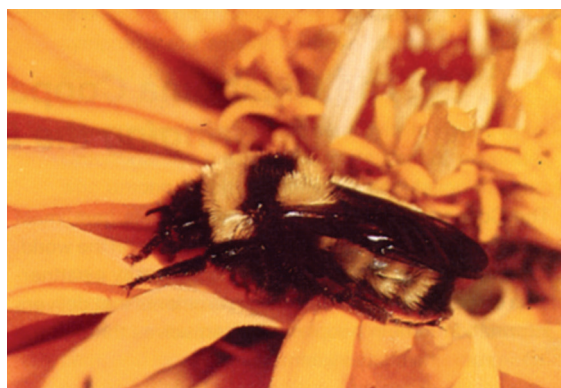
Figure 5. Bumble Bee.

Their underground colonies are small, compared to honey bee hives and contain only a few hundred bees by late summer. Their nests are composed of wax posts provisioned with nectar