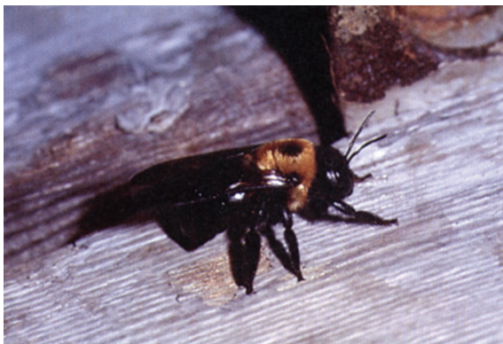
Figure 4. Carpenter Bee.

Adult carpenter bees overwinter in abandoned nest tunnels. In the spring, the survivors emerge, usually in late April or early May, and feed on nectar. Mating occurs a few weeks later and newly fertilized females may either reuse old galleries, construct a new one by lengthening old galleries or bore entirely new ones. The female bores a circular hole (about the size of her body) straight into the wood, across the grain, for a distance of about one inch. Then, the gallery takes a right-angle turn, usually with the grain of the wood and parallel to the outer surface. The entrance and tunnel are clean and sharp. They may appear like they were made with a brace and bit. New galleries average 4