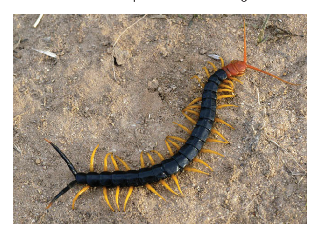
Figure 1. Centipede.

Most adult centipedes spend the winter in secluded, moist areas. They lay their eggs in the soil during the spring and summer. Some centipedes can live as long as five or six