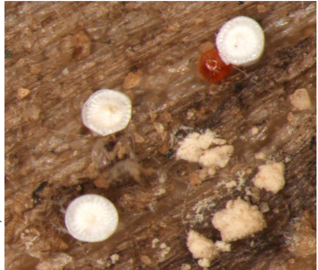
Figure 2. Brown Wheat Mite (BMW) eggs.

Oklahoma Cooperative Extension Fact Sheets are also available on our website at: extension.okstate.edu