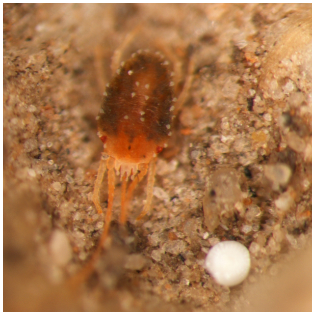
Figure 1. Brown Wheat Mite (BWM).

This mite spends the summer as a dormant, white egg, which hatches in the fall (Figure 2). These mites feed and adults produce red eggs that hatch in about seven days at 72 F. From fall through spring there are multiple generations, each cycling about 21 days, depending on temperatures. Population numbers generally peak in spring. Females of the last generation lay white eggs in the soil that will diapause through the summer and hatch the following fall.