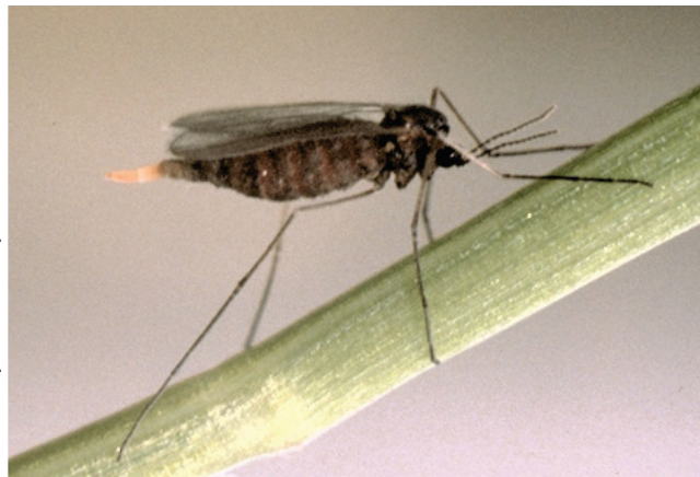
Figure 1. Adult female Hessian fly.

Hessian fly eggs are oblong, orange, measure less than 1/50 inch and can be mistaken for early signs of leaf rust.