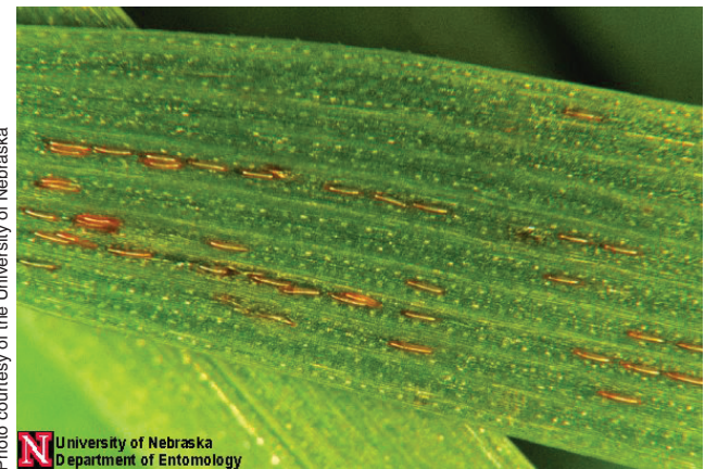
Figure 2. Hessian fly eggs are laid on the upper side of a wheat leaf between the veins. Note the orange color of the eggs are similar in color to leaf rust.

Hessian fly completes its lifecycle in about 40 days to 50 days, but once the "flaxseed" stage is reached, it may remain dormant for three months to four months. After emergence and mating, the female fly lays eggs in between the leaf margins of its host plant. Newly hatched larvae crawl down the plant and begin feeding in the area between the sheath and stem just above the crown, just below the soil surface (fall) or between the stem and leaf sheath at the first node above the soil surface (spring). The fall generation overwinters as flaxseed, emerging in spring; the spring generation oversummers as flaxseed in wheat stubble, emerging in the fall.