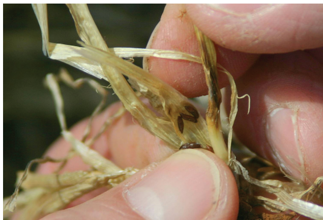
Figure 4. Full-grown Hessian fly larvae form rice-like puparia that are shiny and dark brown. The puparium is commonly referred to as a “flaxseed.”

Oklahoma experiences two to three generations per crop season, but two major generations occur—one in the fall, and one in the spring. Flushes of emerged Hessian flies may occur during the winter or spring when temperatures exceed 45 F to 50 F for an extended time. A recent study followed the emergence patterns of Hessian fly for two growing seasons using pheromone traps and showed the fall generation adults emerged from mid-October through early December and spring generation adults emerged from March through May.