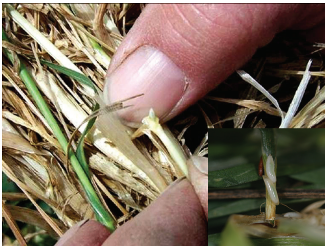
Figure 3. The second instar larvae of the Hessian fly can be found by splitting open stems in late winter. Note the whitish/green color of the larvae at this stage.