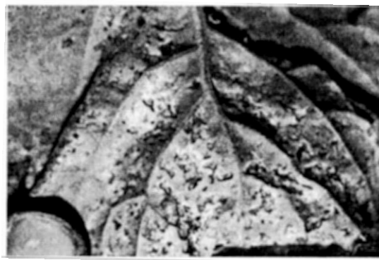
Fig. 2. Water-soaked spots on lower side of turnip leaf are typical of bacterial leaf spot and peppery leaf spot.

Symptoms - The name peppery leaf spot refers to the tiny leaf spots caused on cauliflower. On leafy greens, leaf spots range in size from tiny lesions (1/8-inch) to larger, spreading lesions that are angular and confined by the leaf veins (Figure 3). The center of the spots is grey to light brown and spots are