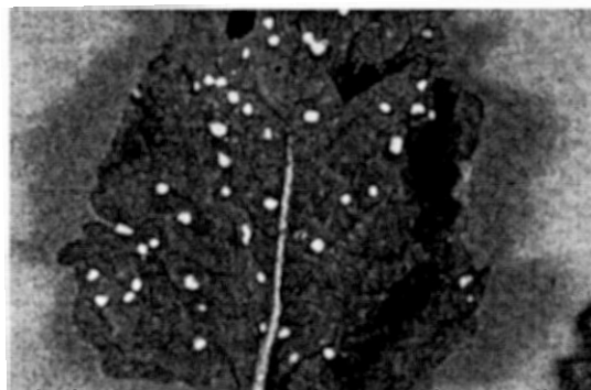
Fig. 7. Anthracnose on turnip leaf showing small circular spots.