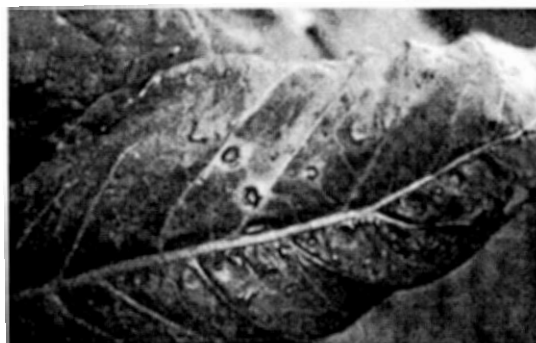
Fig. 6. Black spot on turnip leaf. Note the dark rings within and yellow borders surrounding the spots.

Anthrachnose has been reported to occur in Oklahoma, but recently has been a minor problem. The disease is most severe on turnip, but can also attack kale, collard, mustard, and turnip x mustard. The fungus persists in infested crop residue and crucifer weeds but also may be carried on seed. Warm (79 to 86°F), wet weather favors infection and disease development.