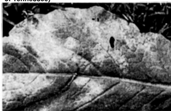
Fig. 9. Yellow leaf spots on upper side of turnip leaf caused by downy mildew.

White rust is a chronic disease problem for spinach production in Oklahoma. White rust of crucifers, which is caused by a different species of the white rust fungus, has not been severe in Oklahoma, but has been reported. The fungus persists in soil as resistant spores that can survive for many years and initiate disease cycles. Thereafter, disease increases from airborne spores that spread within and between fields. Cool (60 to 77°F) and wet weather is favors infection.