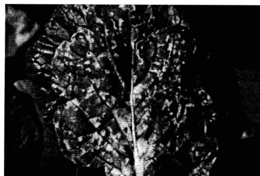
Fig. 3. Peppery leaf spot on upper side of turnip leaf. Note the angular shape of the spots.

usually surrounded by a yellow border. On the undersides of leaves, spots are first water-soaked and then dry and turn brown in color (Figure 2). Severely infected leaves or areas on leaves turn yellow before dying.