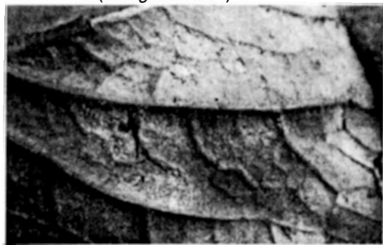
Fig. 8. White mildew on lower side of turnip leaf caused by downy mildew.