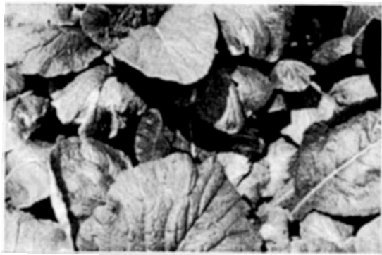
Figure 1. Turnip with V-shaped lesions at the leaf margins caused by black rot.

Symptoms - Plants at any stage of development are susceptible. Seedlings from infected seed die quickly and serve as sources of the bacteria that infect other plants. On true leaves, the disease is easily recognized by the presence of yellow V-shaped lesions extending inward from the leaf margins (Figure 1). The center of the lesion dries out and turns brown, and veins within the lesion appear blackened. The lesions extend into the leaf, killing large areas of affected leaves. Older leaves with lesions may develop numerous black, oval spots on the petioles and soon drop from the plant. Cutting into stems and petioles of severely affected plants reveals a black discoloration of the vascular system.