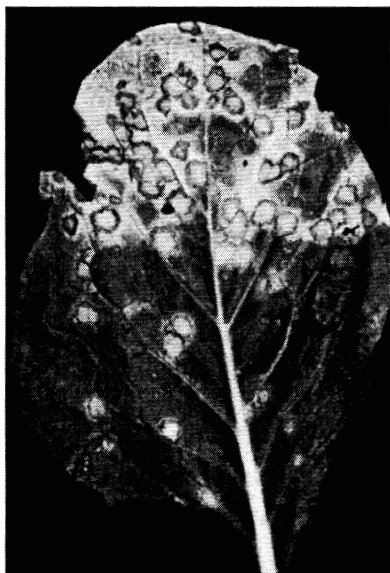
Fig. 5. White spot on turnip leaf producing circular spots with dark borders.

Black leaf spot is less common than white leaf spot in Oklahoma, but it can be a problem on turnips and collards. The fungus can be carried on seed, but also persists in infested crop debris and alternate weed hosts. Spores of the fungus are spread mainly by wind and splashing rain. At least nine continuous hours of dew or rain are required for infection. Optimum temperatures for infection range from 75 to 82°F.