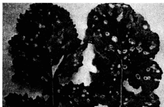
Fig. 10. White rust on mustard showing circular, white, blister-like spots on lower side of leaves.

Control - Cultural practices help prevent foliar diseases from becoming established in a crop. Incorporate crop residue soon after harvest to hasten decomposition. Practice crop rotation with non-crucifer crops for at least two years. These cultural practices reduce pathogen populations and delay initial infections. Moldboard plowing helps prepare a well-drained seed bed that is free of plant residues. Plant high-quality seed produced in dry climates and treated with a fungicide to reduce the likelihood of introducing disease on seed. Seed testing procedures are not available for fungal diseases. Therefore, seed treatment with a fungicide is recommended. Control weeds in and around fields, particularly wild crucifers, which may harbor fungal diseases. Leaf spot diseases may develop during periods favorable for infection in spite of these preventive practices. Fungicide sprays, then, are the only method for control. Fungicides should be applied according to label directions and repeated if conditions favorable for infection persist. Be certain that a particular fungicide is registered for the target disease and crop. Some fungicides are labeled only for one or two of the leafy greens crops. If possible, anticipate disease problems and begin a spray schedule before economic damage occurs.