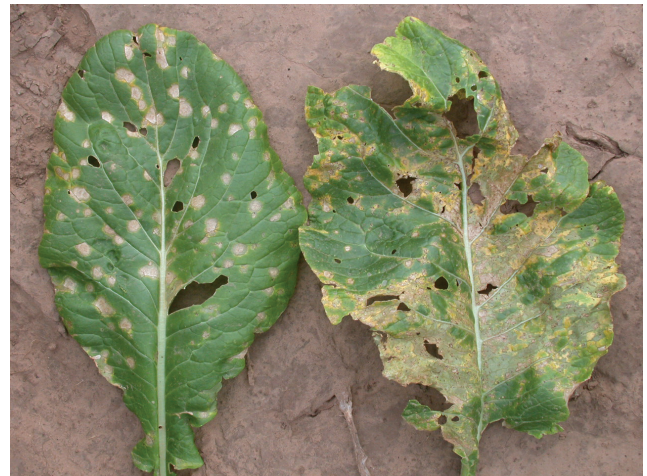
Figure 3. Turnip leaves with white spot caused by the fungus Cercospora (left) and Xanthomonas leaf spot caused by bacteria (right).

Symptoms - Leaf spots are at first small, circular to angular in shape, grey to light brown in color, and appear oily or water-soaked on the lower leaf surface (Figure 4). Bacterial leaf spots typically lacks the pronounced yellow border that surrounds spots caused by Xanthomonas leaf spot. Spots expand, coalesce into irregular shapes, turn light brown in color, and may advance along leaf veins (Figure 5). Severely infected leaves dry and become brittle as they are killed.