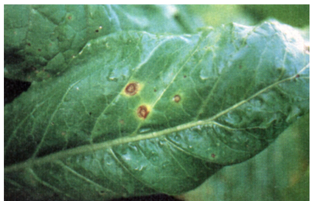
Figure 7. Black spot on turnip leaf.

Anthrachnose occurs in Oklahoma, but is less common than white spot. The disease is most severe on turnip, but can