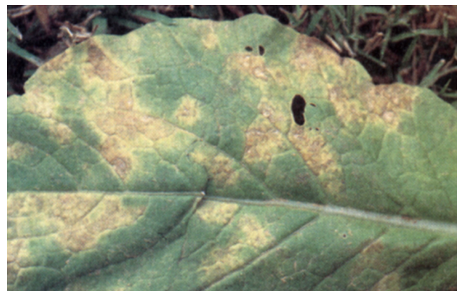
Figure 10. Yellow leaf spots on upper side of turnip leaf caused by downy mildew.