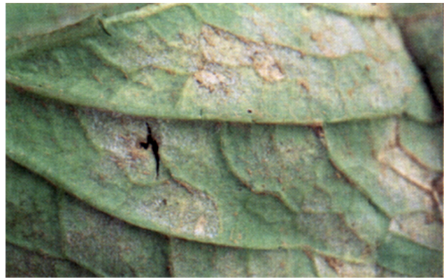
Figure 9. White mildew on lower side of turnip leaf caused by downy mildew.

Control - Cultural practices help prevent foliar diseases from becoming established in a crop. Incorporate crop residue soon after harvest to hasten its decomposition and reduce pathogen survival. Practice crop rotation with non-crucifer