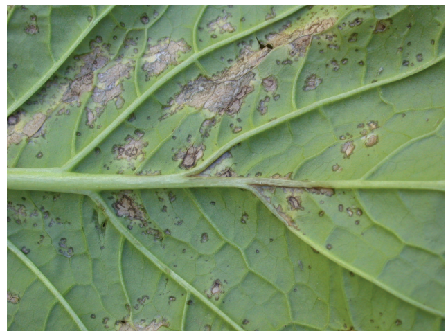
Figure 4. Underside of turnip leaf with bacterial leaf spot.