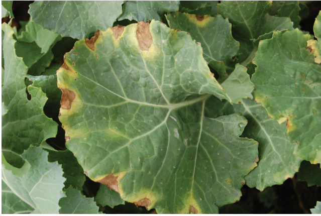
Figure 1. Kale with V-shaped lesions at the leaf margin caused by black rot.