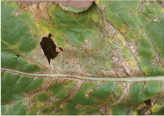
Figure 5. Upper side of turnip leaf with bacterial leaf spot.

Control - Control of bacterial diseases is effective only when the pathogen(s) are excluded from fields. Once bacterial pathogens are present in a field, control will be impossible under conditions favorable for infection. Purchase seed that has been tested and certified to be free of black-rot bacteria or hot-water treat seed as previously described. Because the bacterium that causes Xanthomonas leaf spot is closely related to the one that causes black rot, seed testing procedures for black rot also will detect this bacterium. However, seed testing procedures for bacterial leaf spot have not been developed. Plant seed in fields that have not been planted to crucifer crops for at least two years so that residue from previous crops is completely decomposed. Manage old crop residue to hasten its decomposition because the bacteria survive best on the soil surface and are poor soil competitors. Control of wild crucifers that may harbor bacteria in and around fields may reduce disease. Fields should not be worked while plants are wet because the bacteria are efficiently spread by mechanical means. While crucifers grown for production of leafy greens are usually direct seeded; nearby gardens, transplanted fields, and diseased fields also can serve as sources of the bacterium.