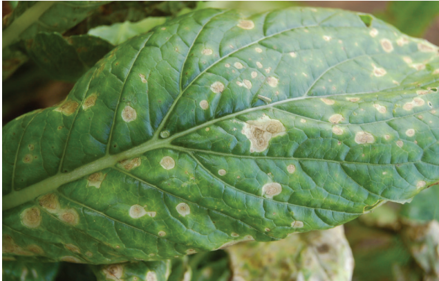
Figure 8. Anthracnose on turnip x mustard leaf.

Symptoms - Leaf spots are small, dry, circular, and pale gray to straw colored (Figure 8). Darker colored areas within the older spots are reproductive structures of the fungus. Severely infected leaves are killed. Spots on petioles are elongated, sunken, grey to brown, and have a dark black border.