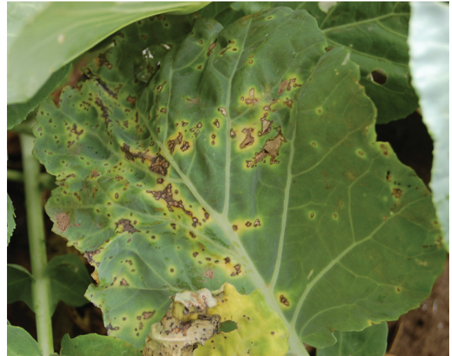
Figure 2. Kale leaf with Xanthomonas leaf spot.

leaves. Older leaves with lesions may develop numerous black, oval spots on the petioles and soon drop from the plant. Cutting into stems and petioles of severely affected plants reveals a black discoloration of the vascular system.