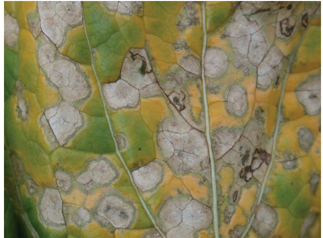
Figure 6. White spot on turnip leaf producing circular spots with dark borders and leaf yellowing.

Leaf spot diseases caused by these two fungi are similar in their symptoms, biology, and damage. Cercospora has been more frequent in recent years, but both are probably present. White spot is most severe on turnip, mustard, and turnip x mustard hybrids. The disease is less important on collards and kale. The fungi persist on infested crop residue and possibly wild crucifer weeds. Spores from debris, weeds, or neighboring fields become airborne and are blown to new fields. The disease has been most severe in the fall production season,