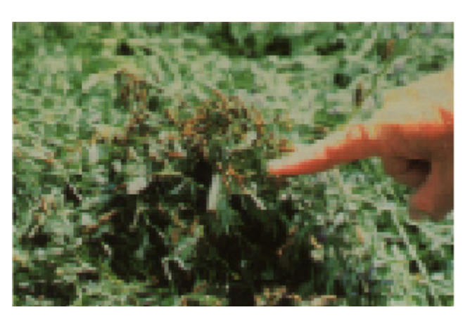
Figure 3. Typical swarm of striped blister beetles found on alfalfa hay.