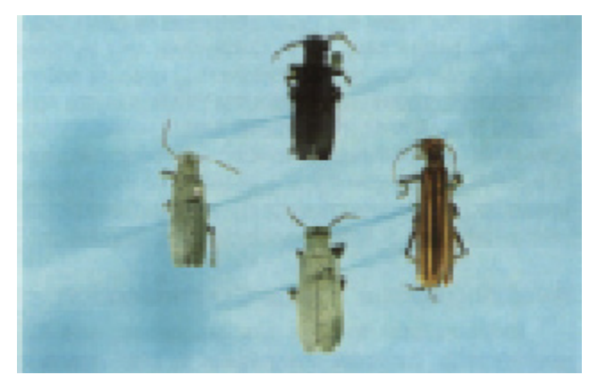
Figure 2. Black, spotted, striped, and gray blister beetles are representative of the many species in the U.S.

the larvae immediately begin searching for grasshopper eggs to consume. Grasshopper eggs are laid in clusters of up to 30 or more within 1 to 2 inches of the soil surface during the late summer and fall. Blister beetle larvae devour clusters of eggs, then overwinter in the soil and emerge as adults in late spring or early summer. When infesting alfalfa, beetles prefer to feed on blossoms but will feed on leaves if blossoms are not present. Pigweed, goldenrod, goathead, puncturevine, peanuts, soybeans, and many other plants also serve as hosts for these beetles.