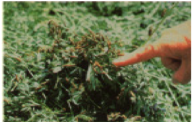
Figure 2. Black, spotted, striped, and gray blister beetles are representative of the many species in the U.S.

Emergence of adult blister beetles typically occurs after