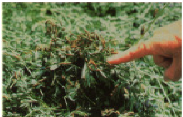
Figure 3. Typical swarm of striped blister beetles found on alfalfa hay.