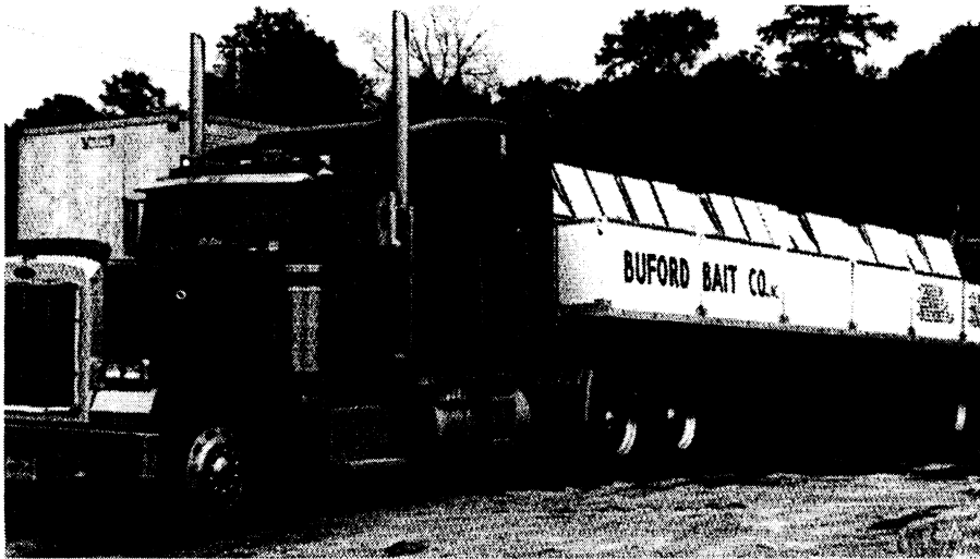
Live hauling truck.