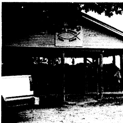
Holding tank and business area for fee fishing operator.

Fee fishing ponds are usually operated seasonally. Most operations are open daily from early morning until dark during spring, summer, and fall. Many operators reduce hours