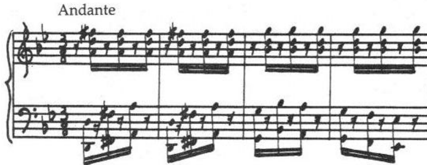
Ex. 3.23, typical malagueña tonal and rhythmic patterns

Albéniz included the striking piece “Malagueña” in España (ex. 3.24). Its melodic and rhythmic patterns are similar to the above example.