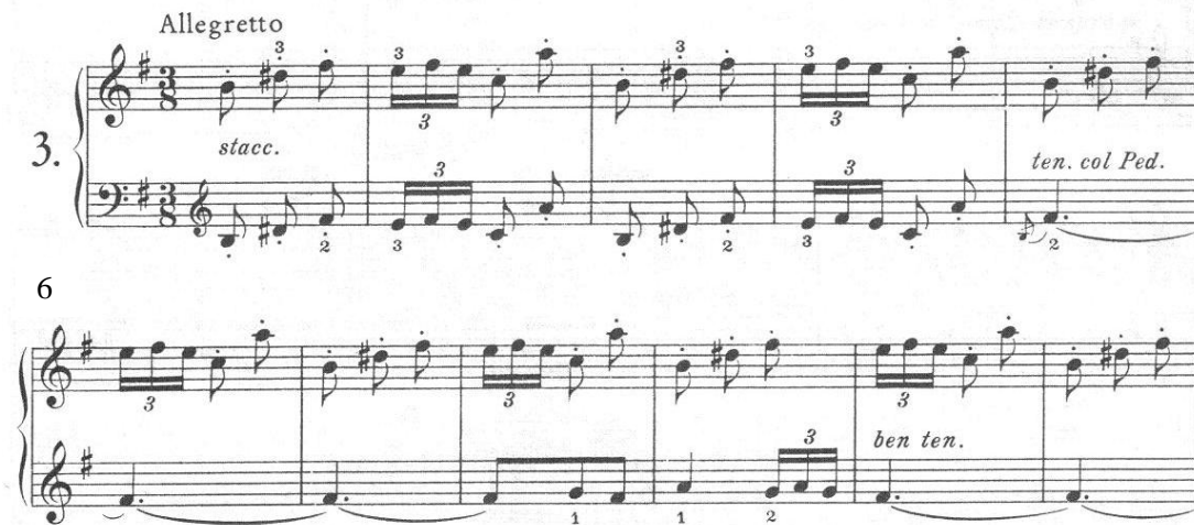
Ex. 3.24 Albéniz, “Malagueña” from España , mm. 1-11

Albéniz included the striking piece “Malagueña” in España (ex. 3.24). Its melodic and rhythmic patterns are similar to the above example.