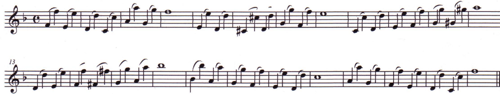
Arban Exercise 8, p.131