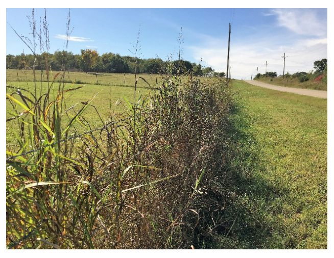
Figure 1. Established Johnsongrass along a fence line.

Oklahoma Cooperative Extension Fact Sheets are also available on our website at: http://osufacts.okstate.edu