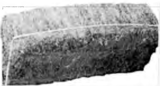
Figure 1. Straw bale for raising crops, flowers and herbs.

Oklahoma Cooperative Extension Fact Sheets are also available on our website at: http://osufacts.okstate.edu