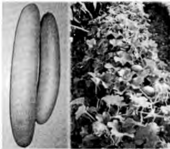
Figure 2. Quality produce (cucumber-left and cantaloupe-right) grown on straw bales in Stillwater, OK without use of any pesticide.

Straw or hay bales can be obtained from several different places. They can be purchased from local stores or obtained directly from a hay producer, or any farmer baling straw. Straw bale house builders may sell unused bales. If purchased, prices range anywhere from $2 to $5 per bale in Oklahoma. Depending on the grower's needs, either old or new bales might be purchased. Old and intact straw bales can be used right away and are generally cheaper than new bales. Purchasing old unused straw bales from farmers or