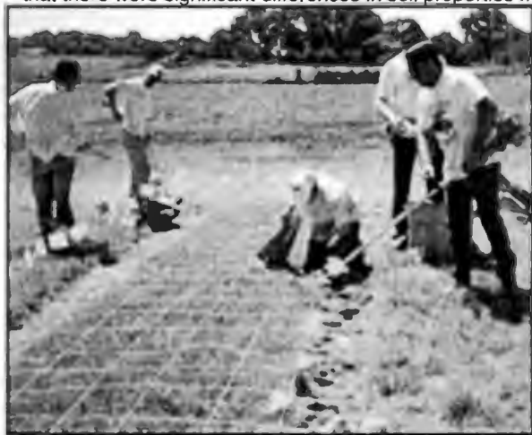
Figure 2. Soil sampling 1 ft 2 showed significant variation in plant available nutrients.

question to Dr. Bill Raun (PSS): "At what resolution are there real differences in the field?" To answer this question, an experiment was conducted to determine the extent of spatial variability of soil properties, and the variability in yield from what was a visibly homogenous area. This was performed by collecting soil and forage samples from every square foot over a 7-foot by 70-foot area (Figure 2). The results showed that there were significant differences in soil properties from