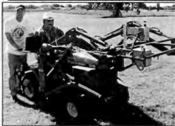
Figure 1. NDVI sensor readings being collected on bermudagrass, Stillwater, OK, 1997.

Oklahoma Cooperative Extension Fact Sheets are also available on our website at: http://osufacts.okstate.edu