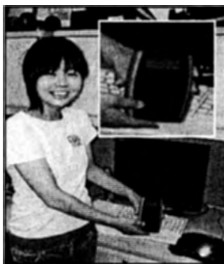
Figure 7. Prototype of the pocket sensor.

The development of sensor-based technologies was timely, coming at a time when producers faced issues with the rising cost of production and the focus on environmental pollution due to overapplication of N fertilizers. Current efforts include the development of a low cost “pocket” sensor (Figure 7). This new sensor is relatively inexpensive and will increase the adoption of this technology worldwide, especially in developing countries where N fertilizers are underapplied due to limited resources.