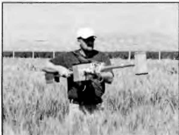
Figure 3. Passive sensor measuring reflectance in spring wheat, Ciudad Obregon MX.

With the benefits of the sensor-based technologies established, there was a need to devise a method to disseminate the findings, therefore in 1996 TEAM-VRT put together two