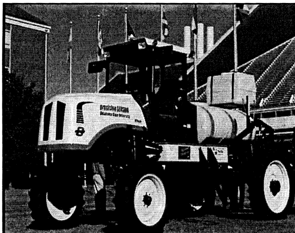
Figure 6. The Cherokee VRT applicator, this sprayer has a 60 ft boom with sensors mounted every 2 ft along the boom.

From 2003 to date, sensor technology and our understanding of its abilities has expanded. This has led to several revisions of the sensor technology since the introduction of the first GreenSeeker™ in 2002. At publishing time of this Fact Sheet, the NUE website hosts 24 SBNRC algorithms for multiple crops, states, and nations. Each algorithm was