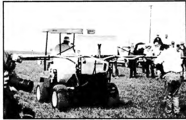
Figure 4. The first demonstration of sensor-based variable N application, Hennessey, OK., 1996

web sites, these two sites have been molded into the current www.nue.okstate.edu website. The web has become an essential tool in the education and use of sensor-based technologies. Since the initiation of the websites, more than 150,000 people have visited these sites