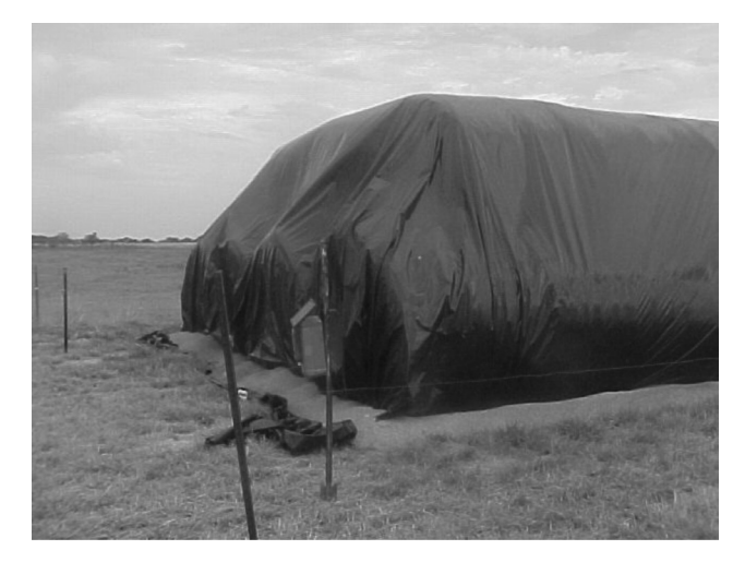
Figure 1. Black plastic sheeting (6 mils thick) covering hay.

Oklahoma Cooperative Extension Fact Sheets are also available on our website at: http://osufacts.okstate.edu