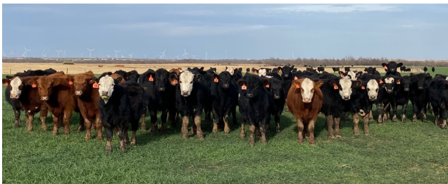
Figure 1. Dual-purpose wheat system. Cattle grazes winter wheat during the winter and should be removed from wheat pasture by first hollow stem stage. Photo taken at Apache, OK.

As early as the 1930s, Kansas State University researchers published Extension bulletins indicating that cattle should be removed from wheat pasture by jointing. Oklahoma State University researchers investigated the issue further in the early 1990s and found that if profitability of the overall wheat stocker cattle enterprise was the primary goal, removing cattle from wheat pasture by jointing was too late. They identified first hollow stem (i.e., the beginning of stem elongation, or just before the jointing stage) as the optimal wheat growth stage for removing cattle from wheat pasture. The purpose of this fact sheet is to explain why first hollow stem is the best time to remove cattle from wheat pasture, provide details on how to identify first hollow stem, and discuss some of the environmental and physiological factors that determine when first hollow stem occurs.