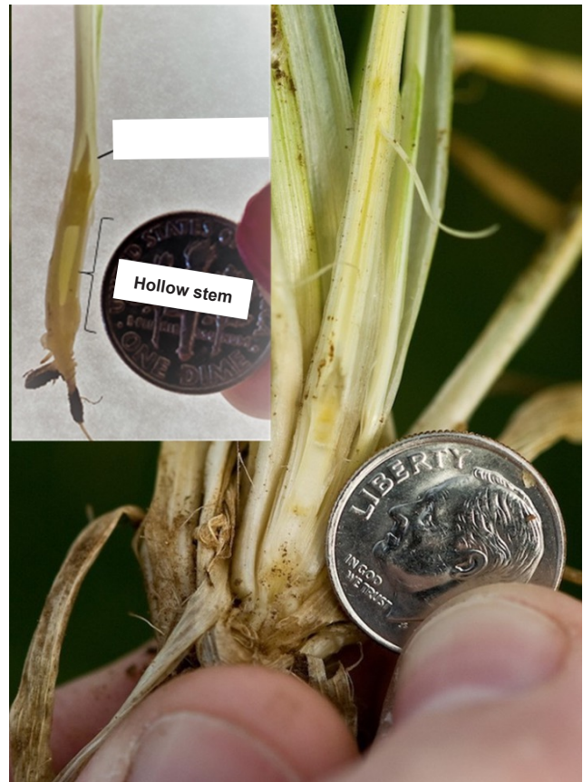
Figure 3. First hollow stem occurs when hollow stem equivalent to the diameter of a dime (1.5 cm) is present below the developing grain head.

Select the largest tillers on the plants. Split the stems open lengthwise starting at the base. A sharp razor or box cutter will make this job easier. If there is 1.5 cm (5/8 inch) of hollow stem below the developing wheat head (Figure 3), the wheat is at first hollow stem stage. The 1.5 cm is about the same as the diameter of a U.S. dime, making the dime a perfect measuring device for first hollow stem.