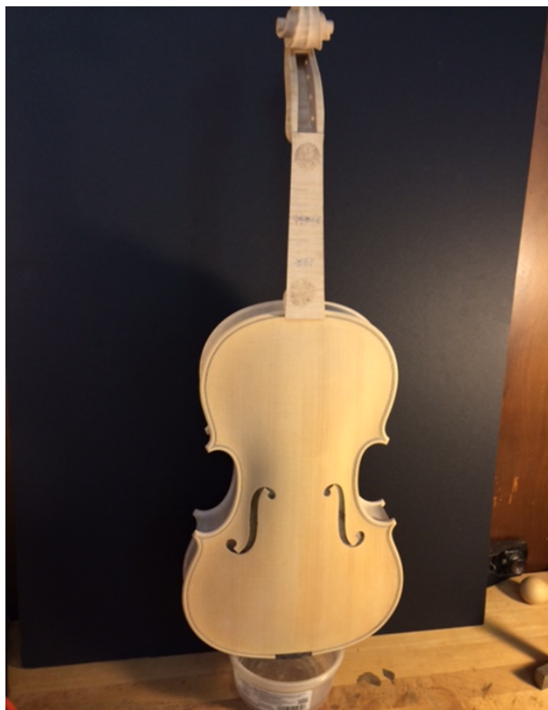
Figure 3. Semi-finished violin.