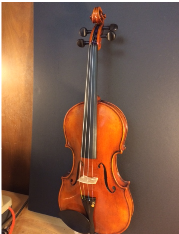
Figure 3. Finished violin.