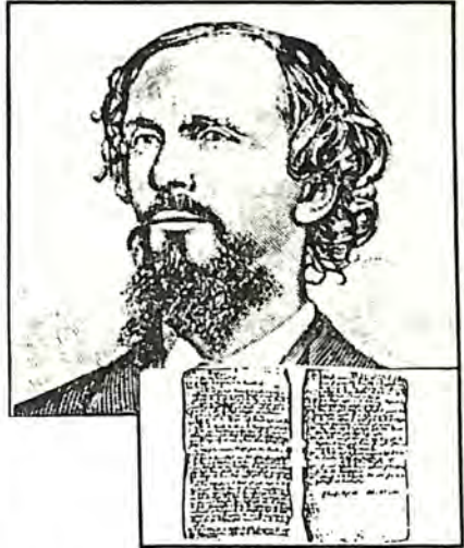
Karl Heinrich Ulrichs - proposed bylaws for gay organization in 1865 (Inset: Original copy of bylaws)

Donations are desperately needed to finance the National March on Washington for Lesbian and Gay Rights and can be sent to: March on Washington, P.O. Box 7781, Washington, D.C. 20044. To volunteer for the March or for additional information, call (202) 783-1828.