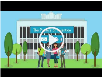
Exhibit Opening: Poetics of Invention

Now open on the main floor of Bizzell, the Poetics of Invention exhibit explores the process of invention from ideation, to fabrication, and to commercialization. Follow OU professor Jonathan Stalling as he attempts to make English more accessible to the 350 million Chinese learners by merging the world's two most-spoken languages at the level of their phonetic DNA.