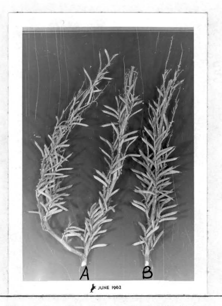
Figure 1. Two types of growth habit of Texsel variety of guar. (A) An erect primary axis with a single basal branch; (B) An erect non-branched primary axis.