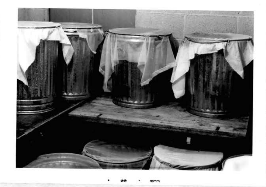
Figure 1. The Containers Used for Rearing Roaches