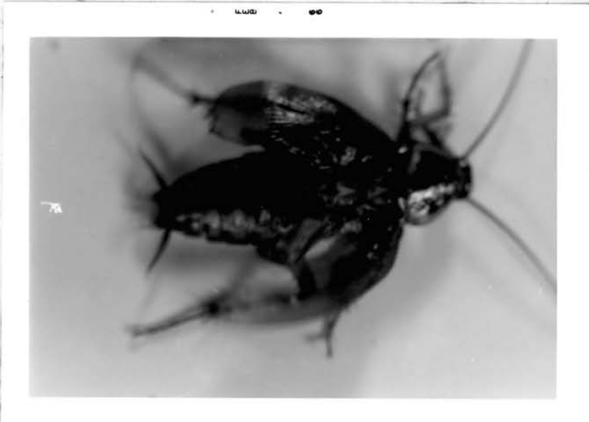
Figure 10. American Roach Adult Showing Wing Deformation Following Inunction Treatment