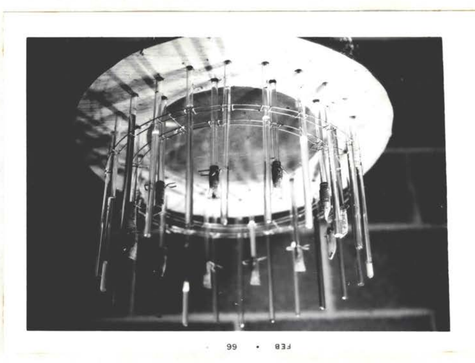
Figure 4. The bottom View of Liquid Food Experimental Unit Showing Consumption and Evaporation Check Tubes