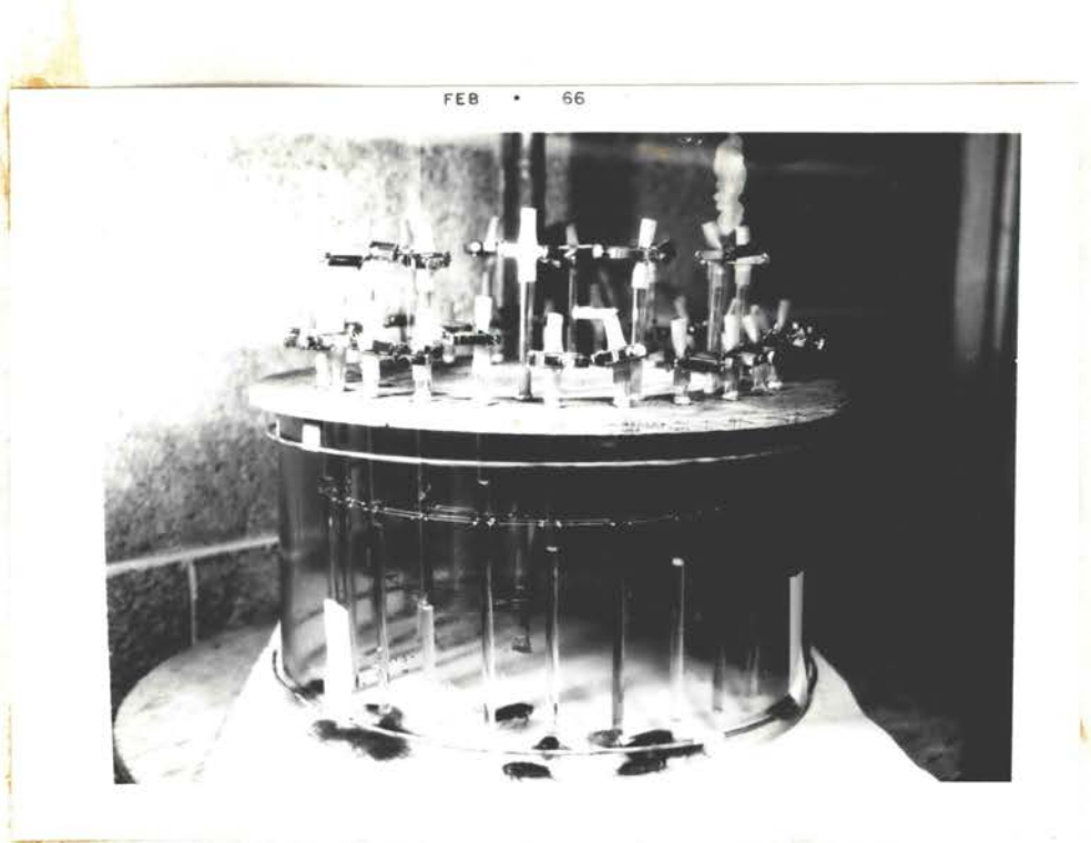
Figure 3. The Liquid Food Experimental Unit Used for American Roaches