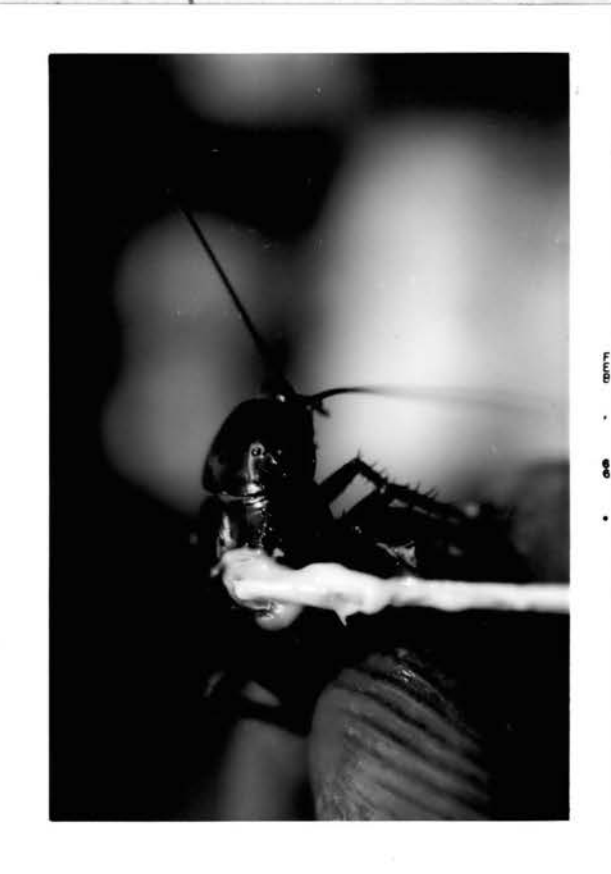
Figure 8. The Inunction Treatment Showing the Meso- and Metathoracic Application