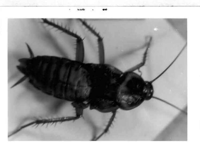
Figure 9. American Roach Numph Showing Alteration of Integument at Inunction Site