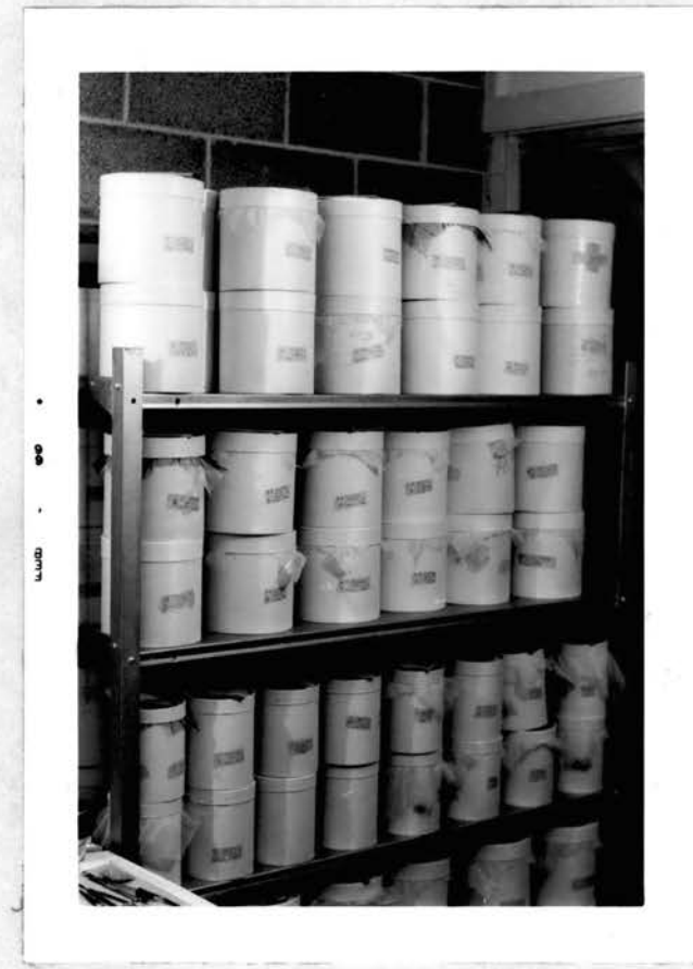
Figure 5. The Arrangement of Quarter- and Half-Gallon Cartons Used for Maintaining German and American Roaches, Respectively, on Treated Food