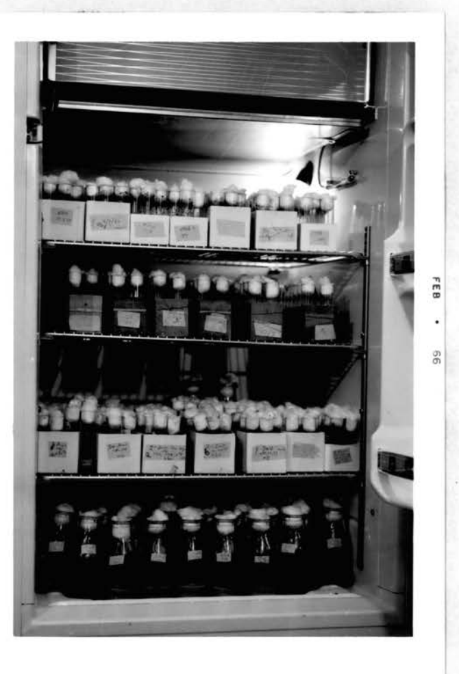
Figure 2. The Incubator used for Maintaining Drosophila