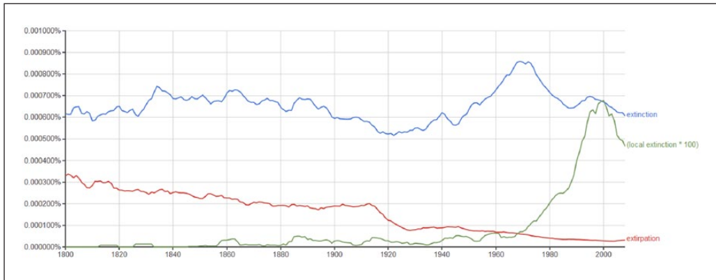
Figure 3. Prevalence of the terms extinction , extirpation , and local extinction (note the different scale), per Google's ngram (run 14 January 2015), from 1800 to present. Usage of extinction has been more or less stable, usage of extirpation has declined steadily, and usage of local extinction spiked upward beginning in the late 1960s.

population” in a section ironically titled “Some reflections on the greatly misunderstood subject of ‘extinction’”—but even then the authors segued into a discussion of species extinction. Even so, it has become rare to find an unmodified use of the term extinction , and some usages in the ecological literature, such as “temporary extinction” (Opdam and Wascher, 2004) and “knowledge extinction” (Papworth et al., 2009), defy logic.