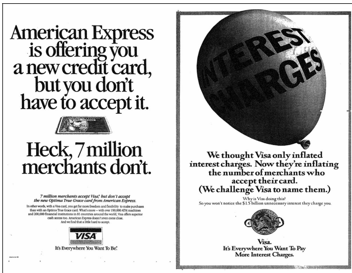
Figure 6. American Express and Visa at War, 1994.

Many sources also mentioned the tendency for combatants to lose focus on selling their products. In the Hardware War, Compaq ran an ad calling for a ceasefire, including the copy "Mudslinging, be it at a political candidate or a computer company, serves little purpose other than to muddy the waters" (Jaben 1992, 3). Referring to the Credit Card Wars, the chairman of a New York management consultancy observed, "It almost becomes defensive communications.... The benefit message is so clouded in irritable language and sort of bullying tactics that I just think most people tune it out" (Levin 1994, 2). Explaining his decision not to join other software vendors in an alliance against Microsoft, a WordPerfect VP-marketing told Business Marketing : "There are times when alliances make a lot of sense, but if the alliance is formed for any other reason than to benefit the customer, it can get off focus" (as cited in Jaben 1992, 3).