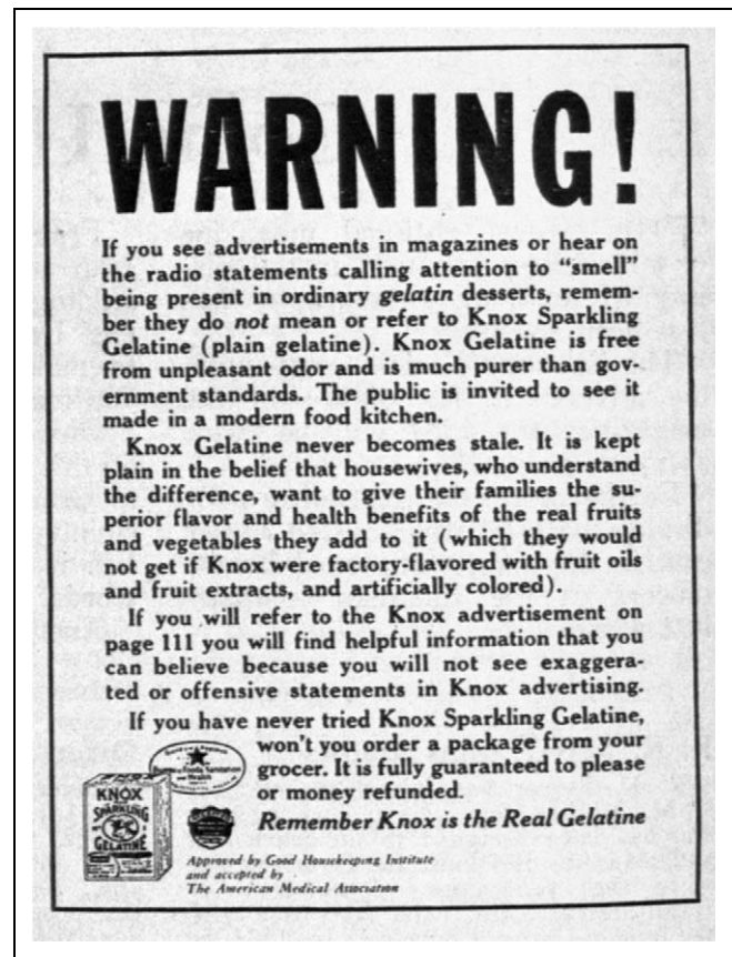
Figure 3. Knox "Warning," 1934.

Printers' Ink identified the "dirty laundry effect" by name in its description of a war between Royal and Knox gelatins, after the former used "gelatine smell" in a disparaging attack. "If the battle of the coffees, which started when Chase & Sanborn, another product of Standard Brands which owns Royal, is any guide, the consumer is in for some unpleasant