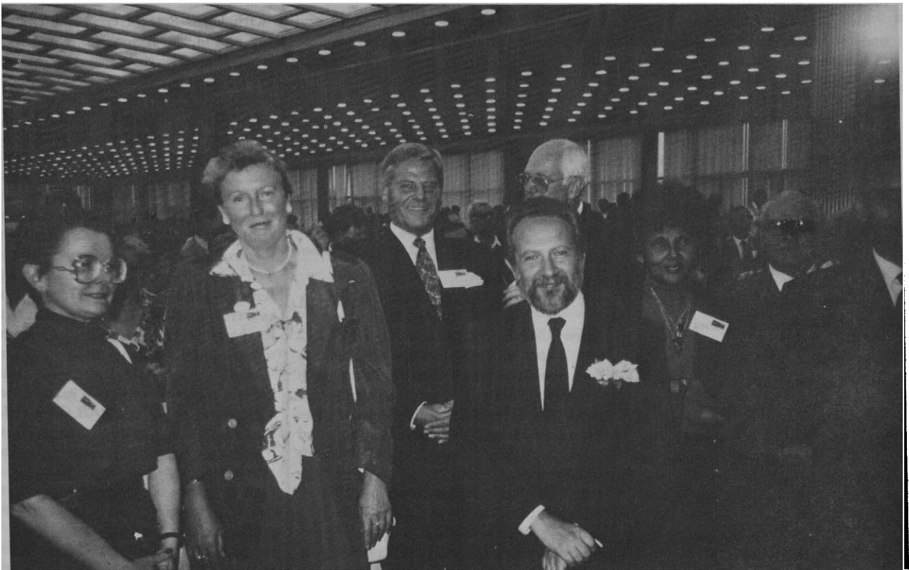
Figure 2. Happiness after the coup: at the IFLA reception in the Kremlin, Moscow, 1991.

A day later some pressure was put on me from delegations to stop the conference. The Secretary General and I decided that everybody was free to leave Moscow but that we would proceed with the conference as scheduled. There were several reasons for this decision: with the exception of the office of president, there had not been any elections for chairpersons of Sections, Divisions or the Professional Board. Stopping the conference, therefore, would have been disastrous to IFLA's professional work and to the Soviet organizers.